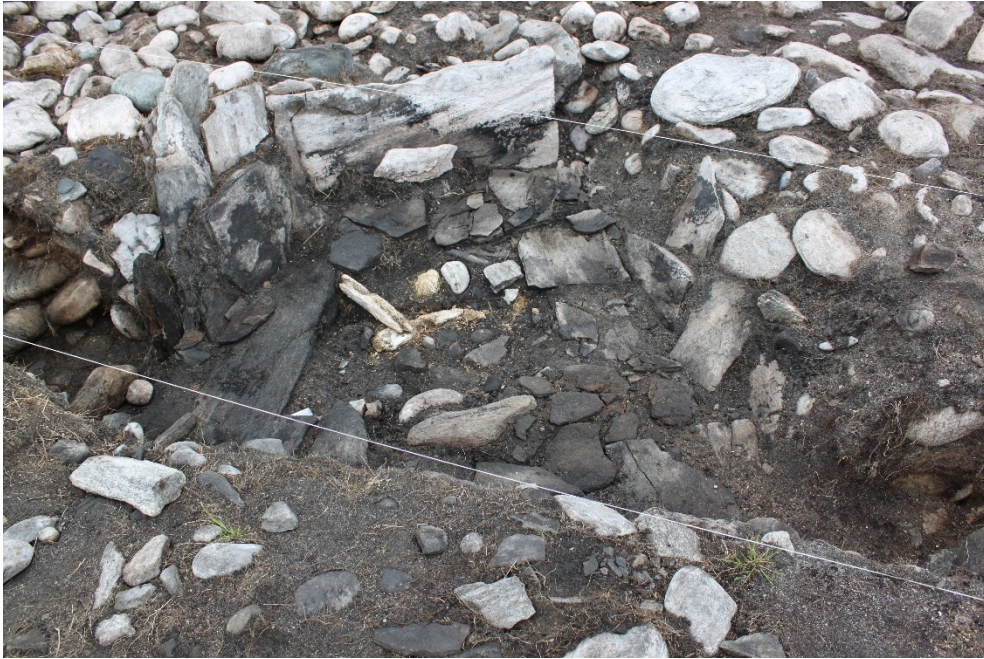
Figure 7. Slab-lined pit in Skjærvika with whale bones in situ.