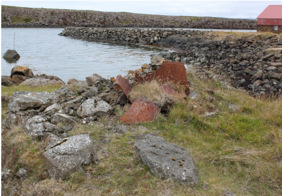
Figure 2. Remains of iron pot used to melt seal blubber in the 20 th century, Breiðafjörður, Iceland.