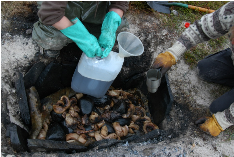
Figure 4. Scooping out seal oil from pit.