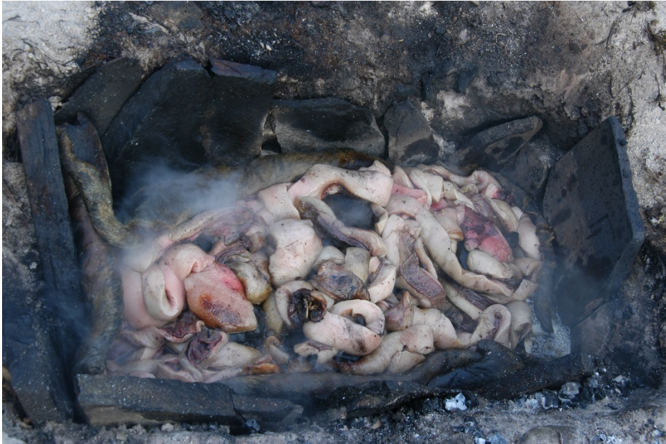
Figure 3. Strips of blubber and preheated stones in slab-lined pit reconstruction (photo: Gørill Nilsen).