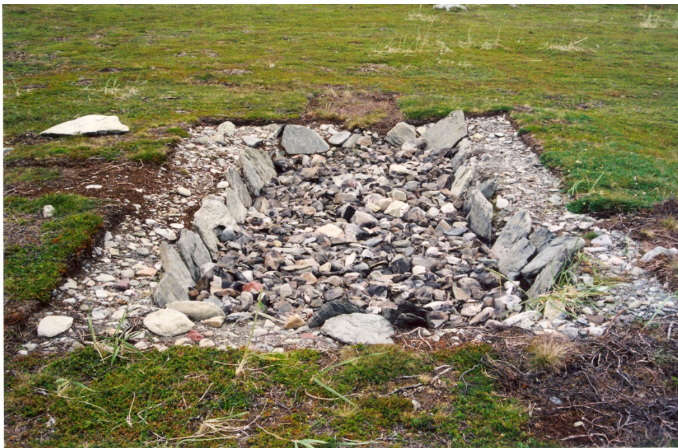
Figure 8. Slab-lined pit at Mellaneset with large amounts of fire-cracked stones. The bottom of the chamber measures 3.8 x 1.8 m (Myrvoll 2011:90). (Photo: Gørill Nilsen).