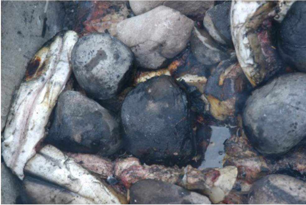
Figure 5. Minke whale blubber and heated stones.