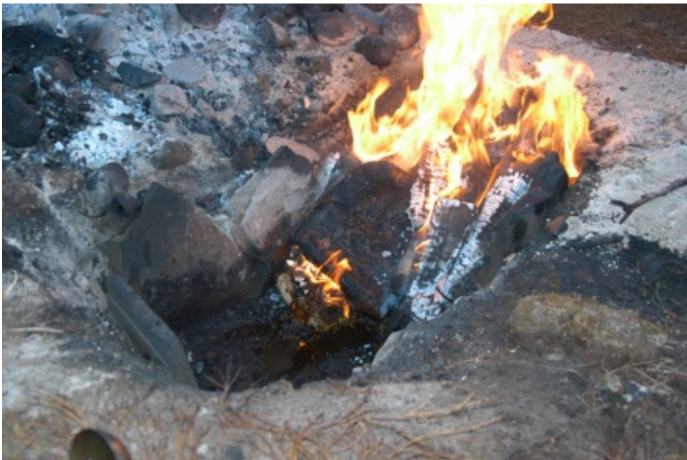
Figure 6. Piece of minke whale blubber as fire fuel (photo: Gørill Nilsen).