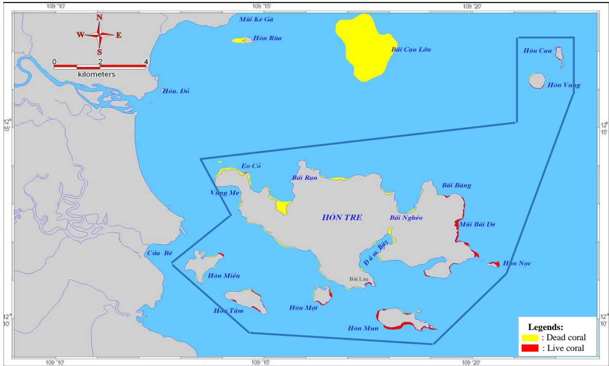
Figure 1. Map of the NTB MPA.