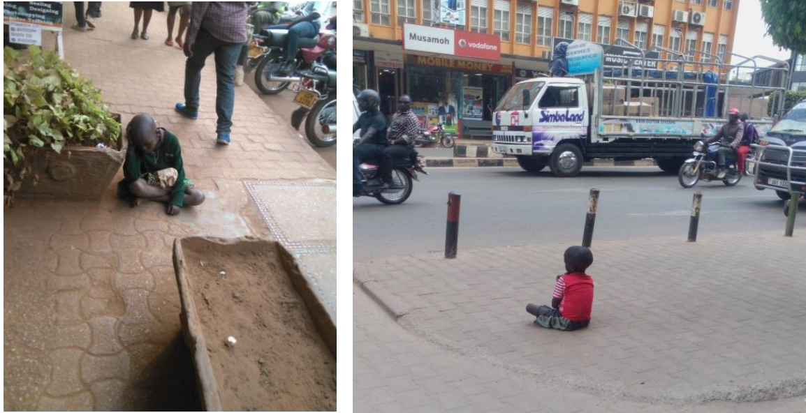
Photo 2: Karamojong children stationed to beg along different streets in Kampala

The advantage of observation is that, at times it happened like a reflex action. Sometimes I could be in town running some errands and for some reason, I started to observe what was going on along the streets. For example, there was a time when I was caught up in a traffic jam along Jinja road, and as we helplessly sat in the taxi stationed in one position, three Karamojong children surfaced suddenly. These were two boys and one girl roughly aged between eight to twelve years of age. They held small towels in their hands and quickly wiped off the dust on the car. In a moment, they came to the driver and politely asked for some money. The driver willingly gave them some coins and they quickly ran away and went to do the same thing to another car. Thereafter, there was a debate in the taxi, some people reprimanded the driver for giving the children money, accusing him of encouraging street beggars. While others applauded him for being kind to such small children who had cleaned his car. All this drew my attention and I kept wondering; can this be classified as begging or rather as a survival strategy by the children. Are they trained by their caretakers to do this, or they just do it on their own? But later when I talked to the chairman of Katwe camp where the Karamojong people resided, he told that the children are usually under the care of an adult and the cleaning of cars is a technique to attract the attention of drivers to give them something.