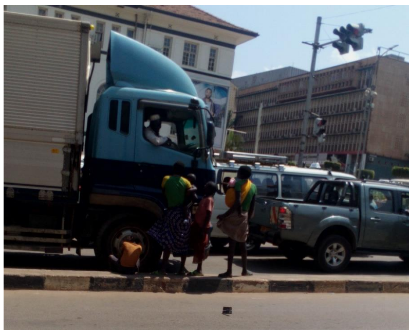
Photo 1: Karamojong women and children begging from a lorry driver

When one walks through the Capital city of Uganda; Kampala, one encounters several beggars along its various streets. Among them, are Karamojong women and children stationed at various places and pleading with by-passers to offer them some thing. ‘ Mpaayo ekikumi ’ a Luganda phrase meaning ‘ give me a hundred shillings ’ is often heard from the women and children. Scenes such as this, and the one captured in the photograph below are a common feature in the central business district of Kampala.