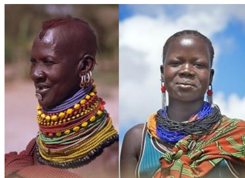
Photo 4: Illustration of Karamojong waist and neck beads, hair style and ear bangles.