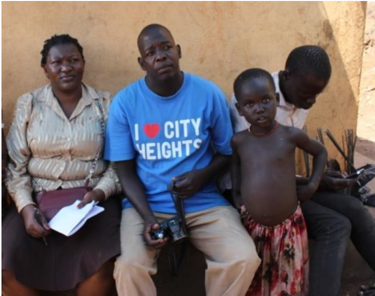
Photo 3: The chairman of the Karamojong people holding a camera which he uses to take pictures of all those who come to do research.

After all these formalities, my assistant and I started to speak to the camp residents. We conducted interviews and listened to their stories. We also followed them to the streets some times to witness what transpires there.