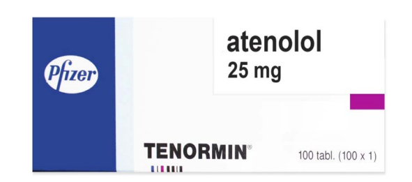
Figure 1 New structured labelling as suggested by Endestad et al.<sup>19</sup>

To counter the risk of unconsciously taking, administering or dispensing more than one product with the same active ingredient, Endestad et al <sup>19</sup> recently