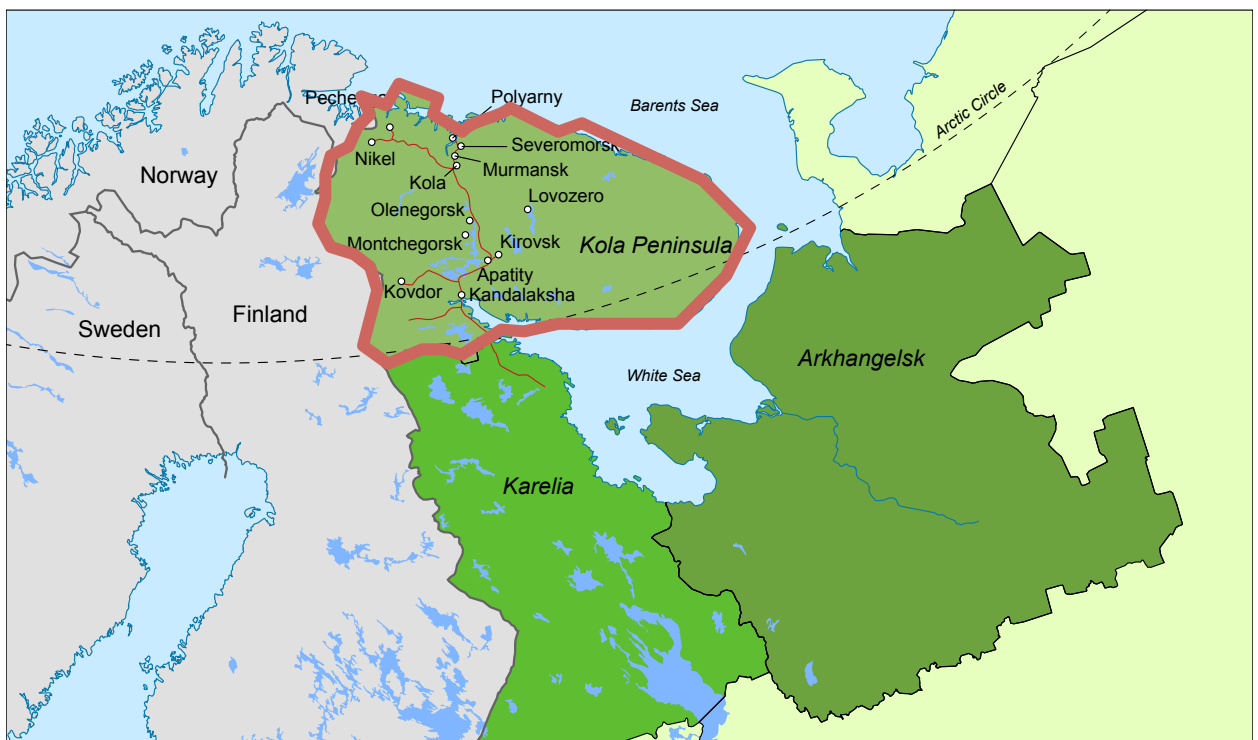
Fig. 2. Map of Murmansk County (the area demarcated by the red line)

The Murmansk County is very rich in natural resources and has deposits of over 700 minerals. The largest industries are mining, refining, apatite concentrate production (for fertilizers), electric power-production, marine transportation, and food-industry, including fishing [87].