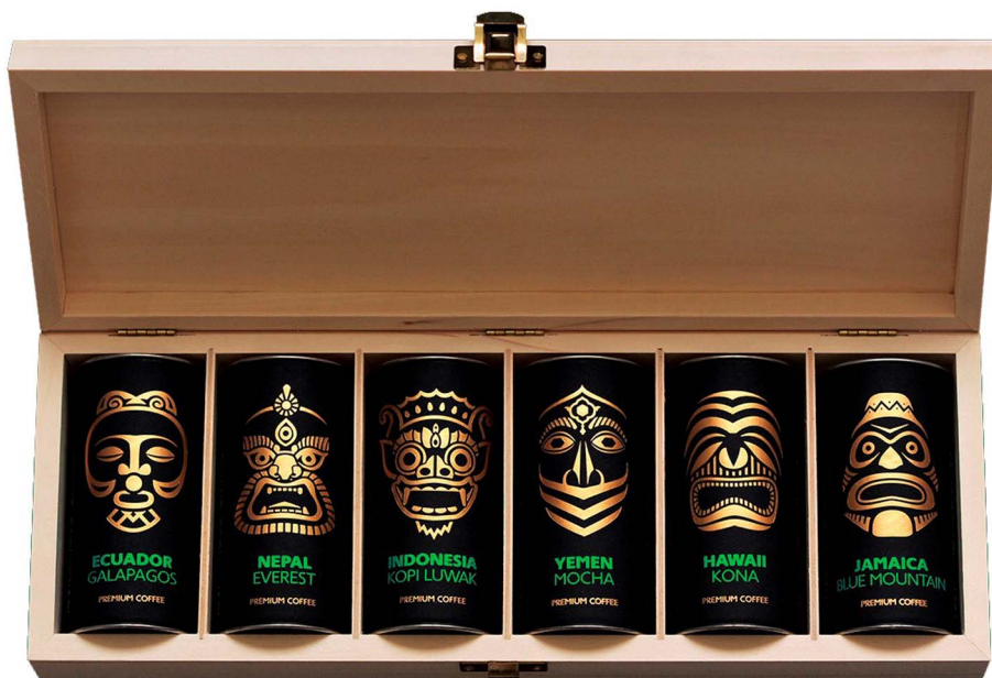
Image 2. A coffee package with green text. (For interpretation of the references to colour in this figure legend, the reader is referred to the web version of this article.)

Only the text of the flavor label on the coffee package was manipulated, and the background was kept constant (black), creating a premium association to the product (Ampuero & Vila, 2006; Ares & Deliza, 2010; Labrecque & Milne, 2013). The flavor label was manipulated for aesthetic reasons. We wanted the text on the package to look like a real product and be convincing to consumers, and thus we manipulated only the flavor label. Images 1 and 2 show the stimuli presented in Study 1.