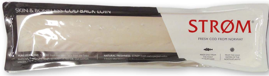
Image 3. A cod package with red text. (For interpretation of the references to colour in this figure legend, the reader is referred to the web version of this article.)