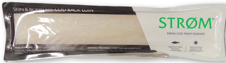
Image 4. A cod package with green text. (For interpretation of the references to colour in this figure legend, the reader is referred to the web version of this article.)

is sold in selected stores in Norway. The price for 400 g (2 servings) is NOK 120, -.”