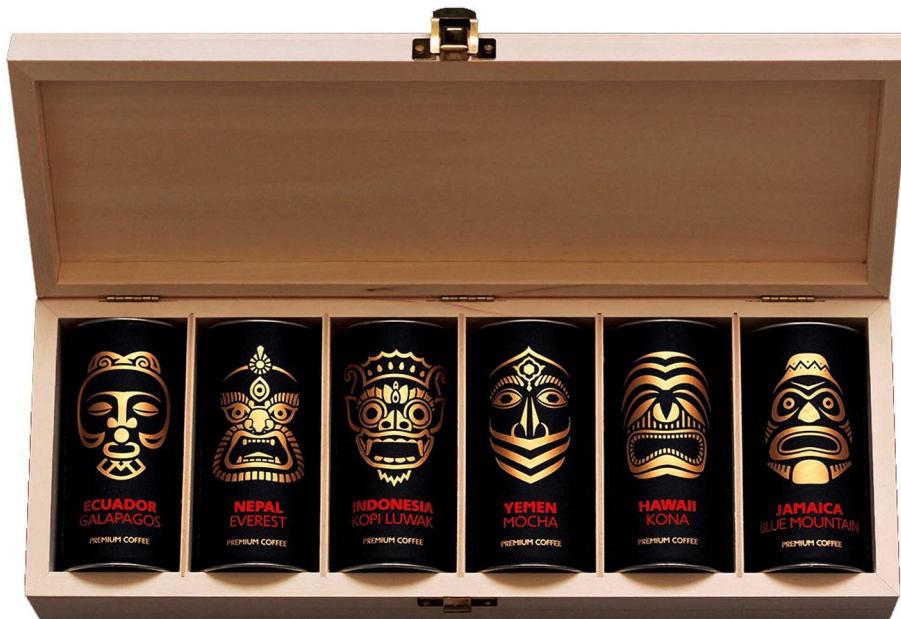
Image 1. A coffee package with red text. (For interpretation of the references to colour in this figure legend, the reader is referred to the web version of this article.)

jury of international bartenders, baristas and chefs described the coffee as the market's most tasty coffee. The coffee is to be offered in the Norwegian market with the flavors of dark roast, light roast, caramel, vanilla, chocolate and the new taste pumpkin & cinnamon. Francesco Sanapo coffee is sold in selected stores in Norway and the price is NOK 249,- for 1 kg."