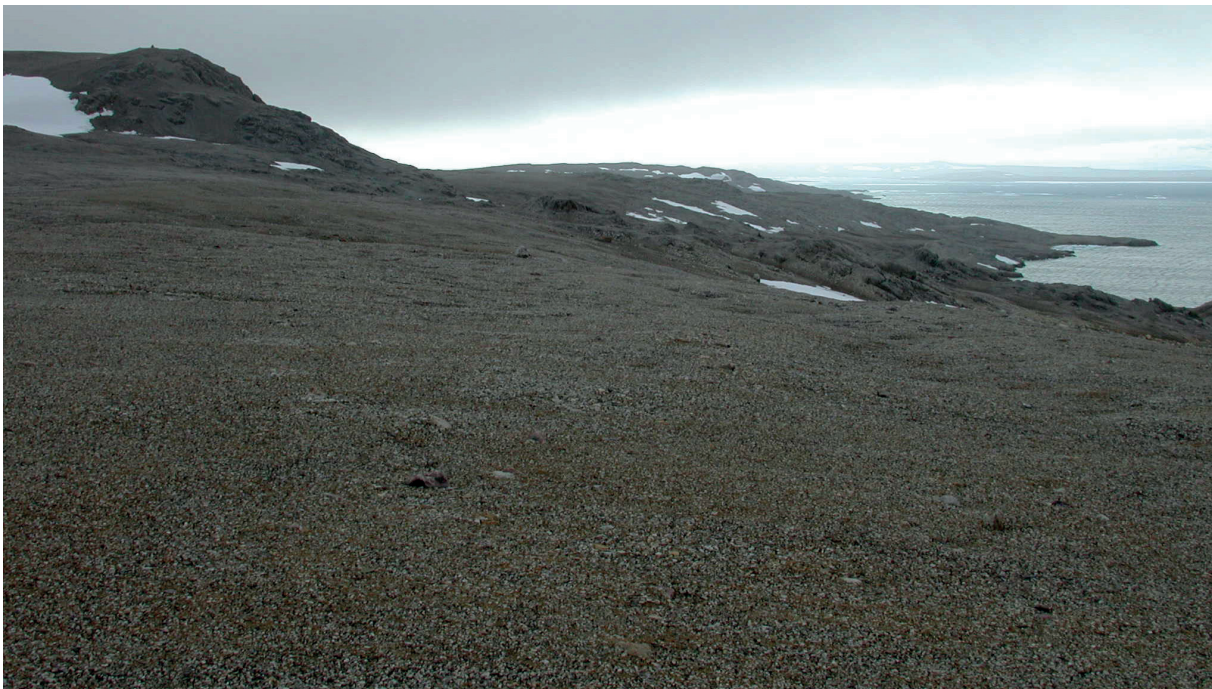
Figure 1: Polar desert vegetation and landscape at Kinnvika, Nordaustlandet, Svalbard, 80° N. The limestone landscape appears to be sterile, but ca. 20 vascular plant species are regularly scattered over the area. Photo: A. Elvebakk, July 2005.

The Subzone A is botanically characterised by occurrence of only 100–120 vascular plants species (Elven et al. 2014, Daniëls et al. 2013). Around 100 species of vascular plants occur in the Russian Arctic polar desert (cf. Aleksandrova 1988, Chernov et al. 2011, Matveyeva & Zanolka 2015). Twenty-five species, or about 20% of the total Subzone A flora, occur all around the polar desert subzone A with more than 80% frequency. These taxa include Alopecurus borealis , Cardamine bellidifolia , Cerastium arcticum , C. regelii , Cochlearia groenlandica , Draba corymbosa , D. micropetala , D. pauciflora , D. subcapitata , Luzula confusa , L. nivalis , Micranthes nivalis , Papaver dahlianum , Phippsia algida , Poa abbreviata , P. arctica , Poa pratensis subsp. alpigena , Potentilla hyperarctica , Puccinellia angustata , Ranunculus sulphureus , Saxifraga cernua , S. cespitosa , S. hyperborea , S. oppositifolia and Stellaria longipes s.l.). In local floras of the Subzone A the species count of vascular plants is about 50. They are not abundant and occur scattered, usually as single specimens.