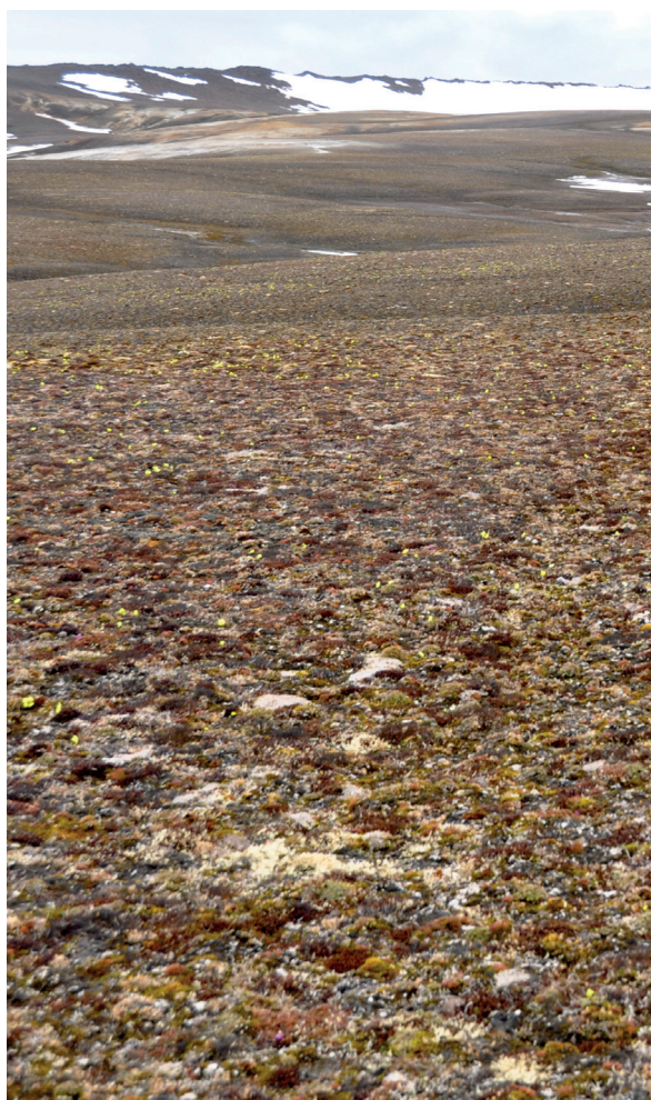
Figure 3: Tundra-like polar desert cushion forb-lichen-moss vegetation near Krenkel Station at 80°38' N on Hayes Island, Franz Josef Land, Russian Federation. Photo: D.A. (Skip) Walker, August 2010.

Slika 2: Splošni izgled vegetacije razreda Drabo-Papaveretea z vrstami Micranthes foliolosa , Papaver dablianum (rumene pike), Saxifraga oppositifolia , S. cespitosa , mahovi in lišaji. Isachsen, otok Ellef Ringnes Island, Nunavut, Kanada na permafrostu z značilnostmi strukturiranih talnih oblik (nerazvrščeni krogi) na rahlo nagnjeni podlagi. Foto: F.J.A. Daniëls, julij 2005.