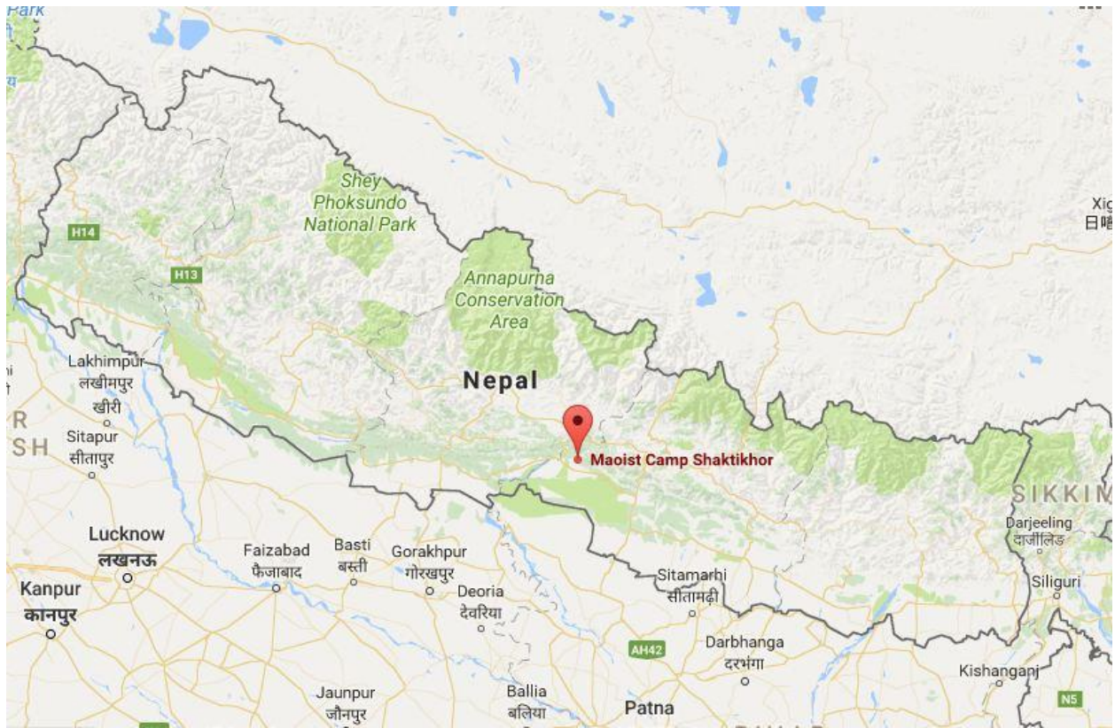
Figure1: Map of Nepal where Shaktikhor, Chitwan was the central region cantonment

Ex-combatants spent more than five years in the cantonment before the final decision was made for so-called reintegration into the army and civilian life. The process was basically top-level politically negotiated, without serious consultation with the mid and lower level fighters who lingered in the cantonments. There was a strong chain of command practice inside the Maoist party and army, resulting in a sense of disempowerment of the several thousand cantoned combatants who were mostly allowed to present their views to their top-ranking leaders. The excessively long time the cantonment and demobilization process took, comes out very clearly in the frustrated statements of many of my informants who stayed (with one exception) in the main cantonment Padampur in Chitwan. Among the cantoned combatants, there were few thousands so-called Verified Minors, whom international society especially pushed the government to release from the cantonment and reintegrate them. The UN formed a quite comprehensive inter-agency program for the verified minors and late recruits (VMLR) demobilization and reintegration. This process created a considerable stir in the cantonments and in the national debate. Again the debate raged about use of terms “Verified Minors” (was seen as insulting by many), which kind of training