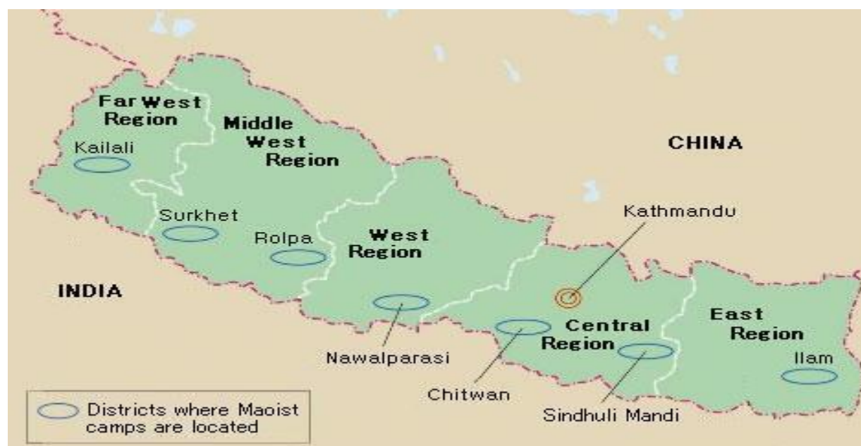
Figure 2: Map of Nepal with Maoist cantonment location

They settled especially in Padampur of Chitwan (my main but not only investigation site), Sainamaina in Rupandehi, Purandhara and Bijauri in Dang, Rajhena and Kohalpur in Banke and Sandepani in Kailali. 73 A Large number of ex-combatants moved to big cities like Biratnagar, Pokhara, Nepalgunj, and in capital city Kathmandu, searching for employment opportunities.