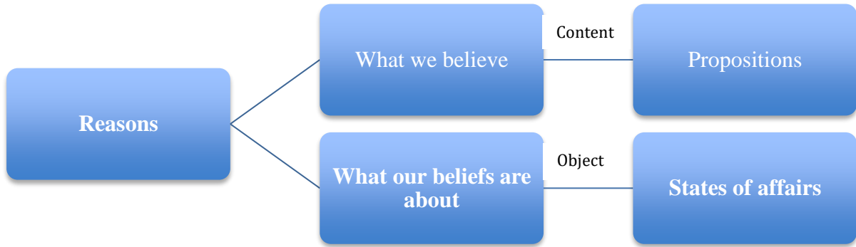
Figure 1. First possible view

The supporter of PRSA, in other words, can, and should, say that reasons are states of affairs in the world and, as such, they constitute the object of our beliefs; yet, this by no means entails that our beliefs need to have non-obtaining states of affairs as their content (or no content at all) – for, the contents of beliefs are correctly identified as propositions.