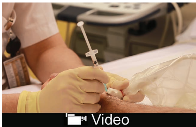
Video Graphic 1. See video, Supplemental Digital Content 1, which shows ultrasound-guided sympathetic block of the radial artery with BTX. This video is available in the “Related Video” section of the Full-Text article on PRSGlobalOpen.com or at http://links.lww.com/PRSGO/A792 .