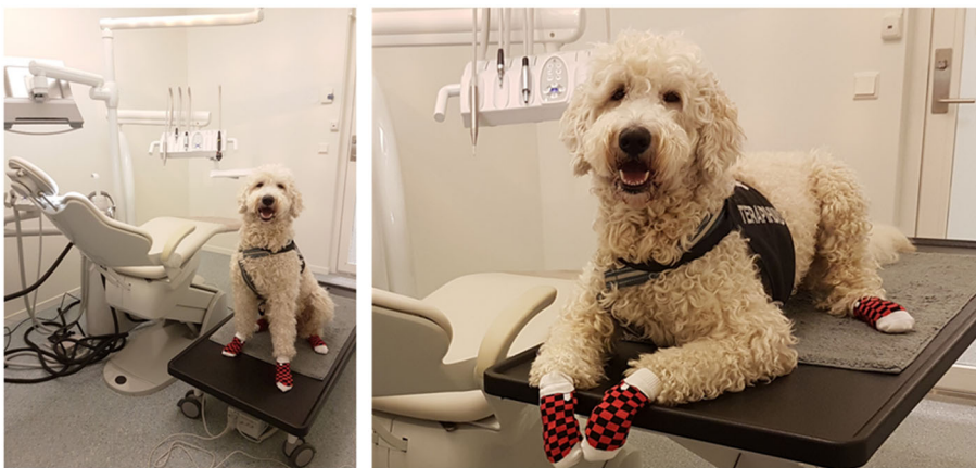
FIGURE 2 A sturdy and mobile professional veterinary table with wheels that can be securely locked and with adjustable height is ideal. The dental therapy dog needs to be trained to adapt effortlessly to this position arrangement.

It may not be necessary to retain the dog in the dental chair (or on the veterinary table) during the entire dental appointment. One approach may be that the patient has the dental therapy dog in the dental chair only the first few minutes to calm down during the clinical examination and local anaesthesia. The dental therapy dog can then move elsewhere and perhaps remain on a floor carpet in the corner of the dental clinic operator. Such an arrangement will reduce the risks of harmful noises and maintain a more distant position away from the hazards described in the previous sections.