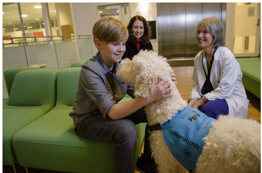
FIGURE 1 The first contact between the patient and the dental therapy dog should be in the waiting area to establish the necessary building of a relationship between the patient and the dental therapy dog.

Most human pathogens are not transmissible to dogs. Hence, the risk of the dog acquiring a communicable disease from a human is low.