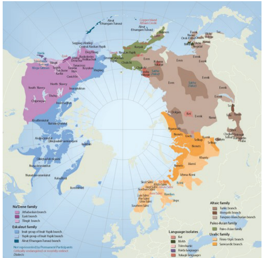
Map of the distribution of languages and language families in the North.