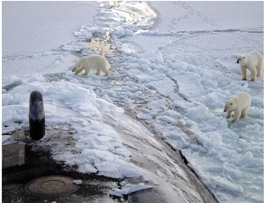
Three Polar bears approach the starboard bow of the Los Angeles-class fast attack submarine USS Honolulu (SSN 718) while surfaced 280 miles from the North Pole. Photo credit: U.S Navy. (Disclaimer: The appearance of U.S. Department of Defense visual information does not imply or constitute DoD endorsement).

In sum, we observe more recent direct changes in military posturing in the Arctic. Increased military presence in the area does not necessarily mean increased risk or an escalation of threats, it is only natural that a changing Arctic requires the ability to police and monitor regional activity, including fulfilling obligations for search and rescue.