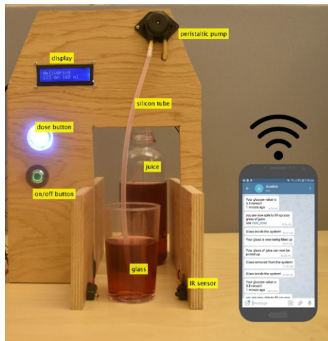
Figure 2: The prototype “House of Carbs”, based on communication with Dexcom G4 CGM and the Nightscout platform.

We built a fully functioning prototype using a Raspberry Pi 3 and an add-on board to control two high-power DC motors. The “House of carbs” includes an additional chatbot application to remotely control the hardware (e.g., clear the pump, remotely turn off the machine), define system parameters (e.g., carbohydrate content and amount of juice present, Nightscout address, units), and send notifications (e.g., “dose ready to be picked up”, “glass removed”), see Figure 2 .