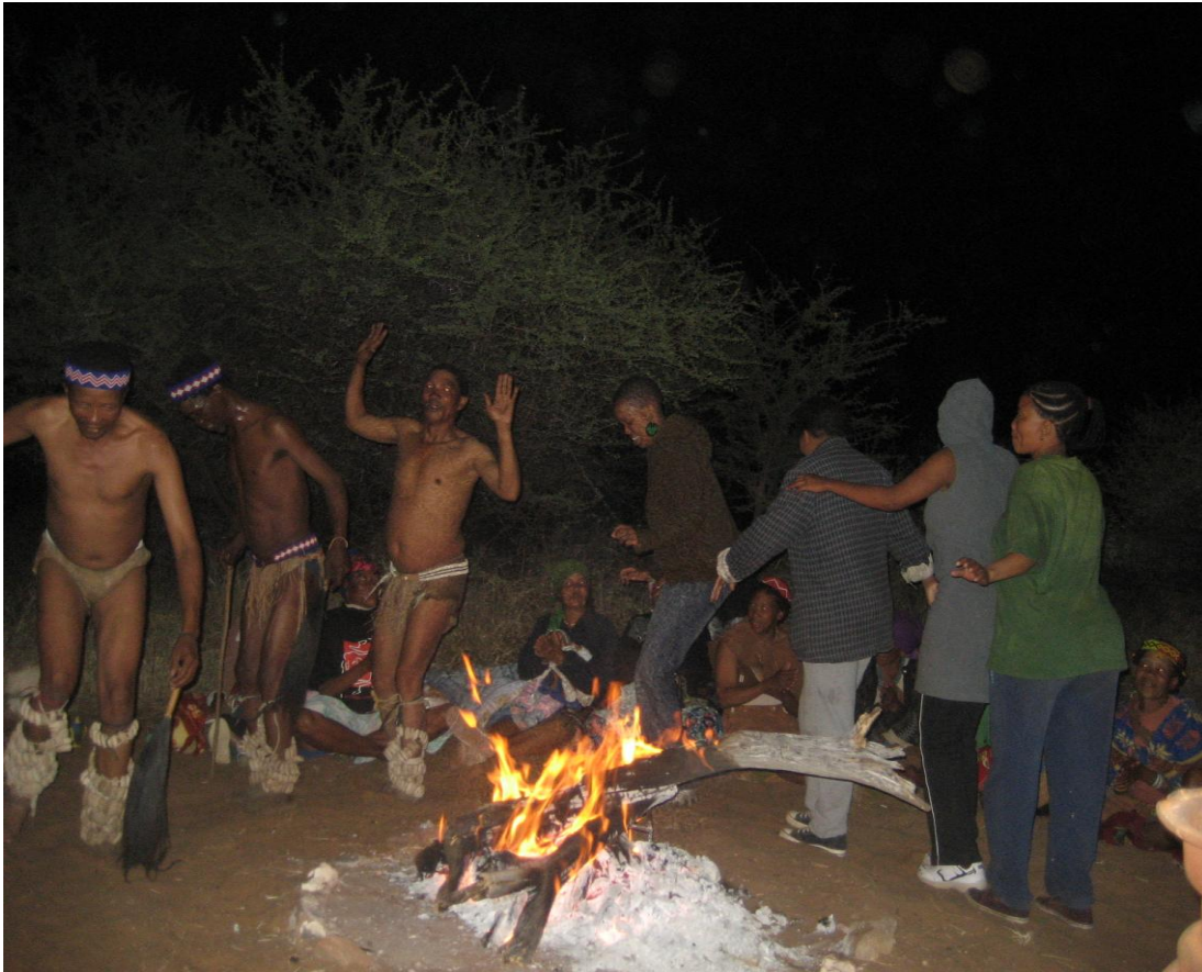
Traditional dance performed by San people. The activity takes place at D'Qare Qare game farm and it is done during the night. Revelers are invited to join in the dance and learn a step or two.