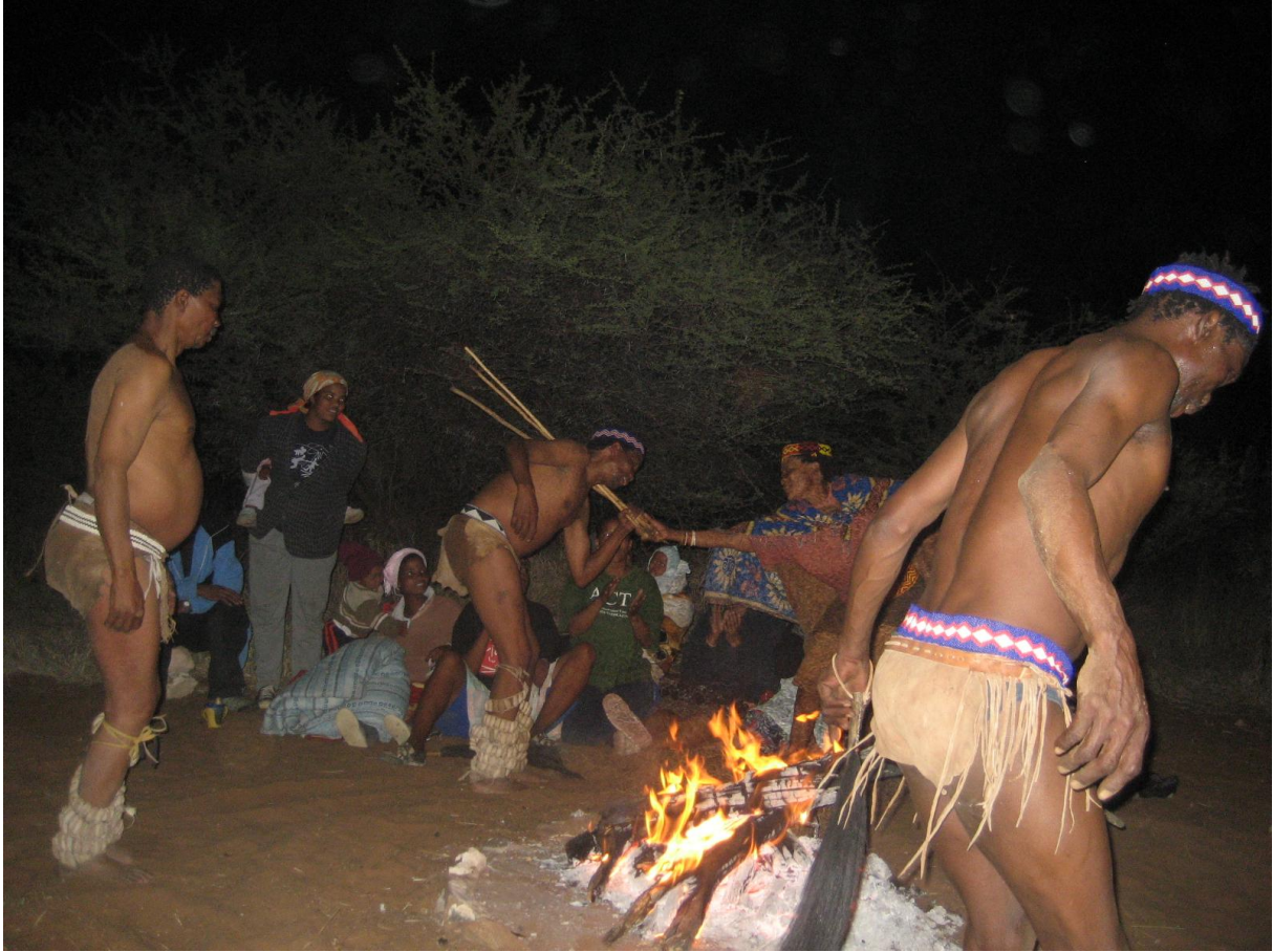
A dance between a man and a woman mimicking what happens when the husband returns from hunting. The woman is seen here in a jubilant mood and welcoming the husband and helping him carry the animal.