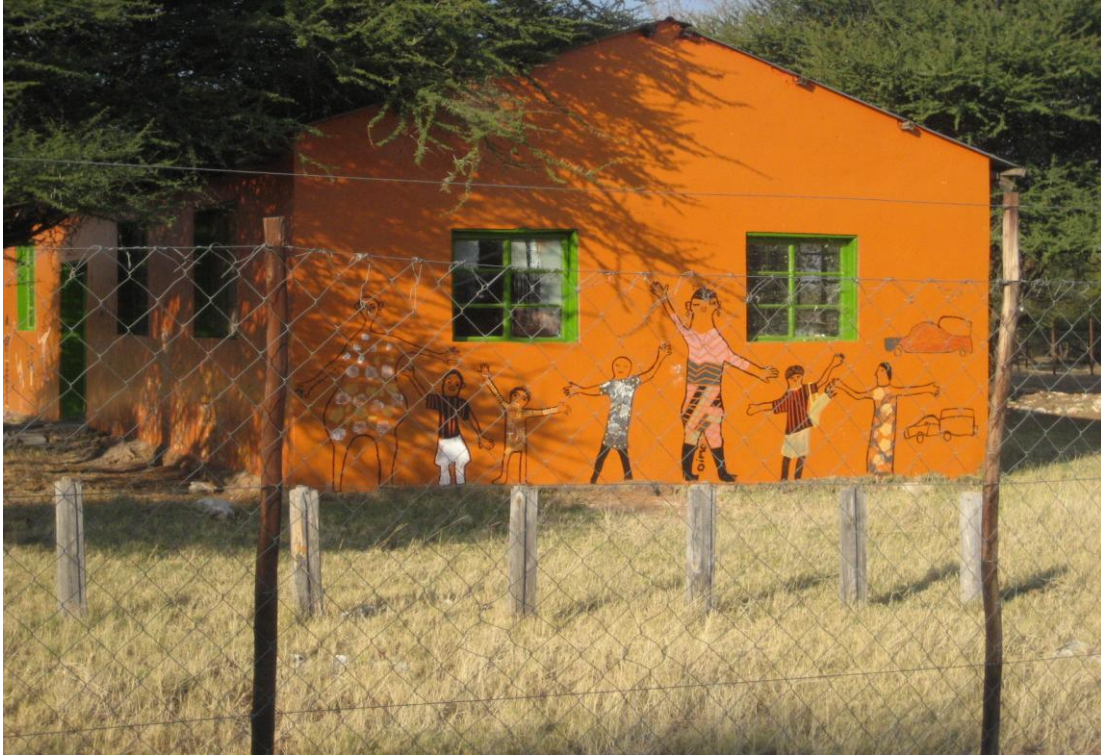
Figure 5. Bokamoso Pre-School