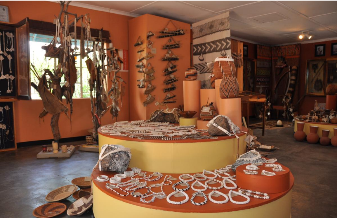
Arts and Craft