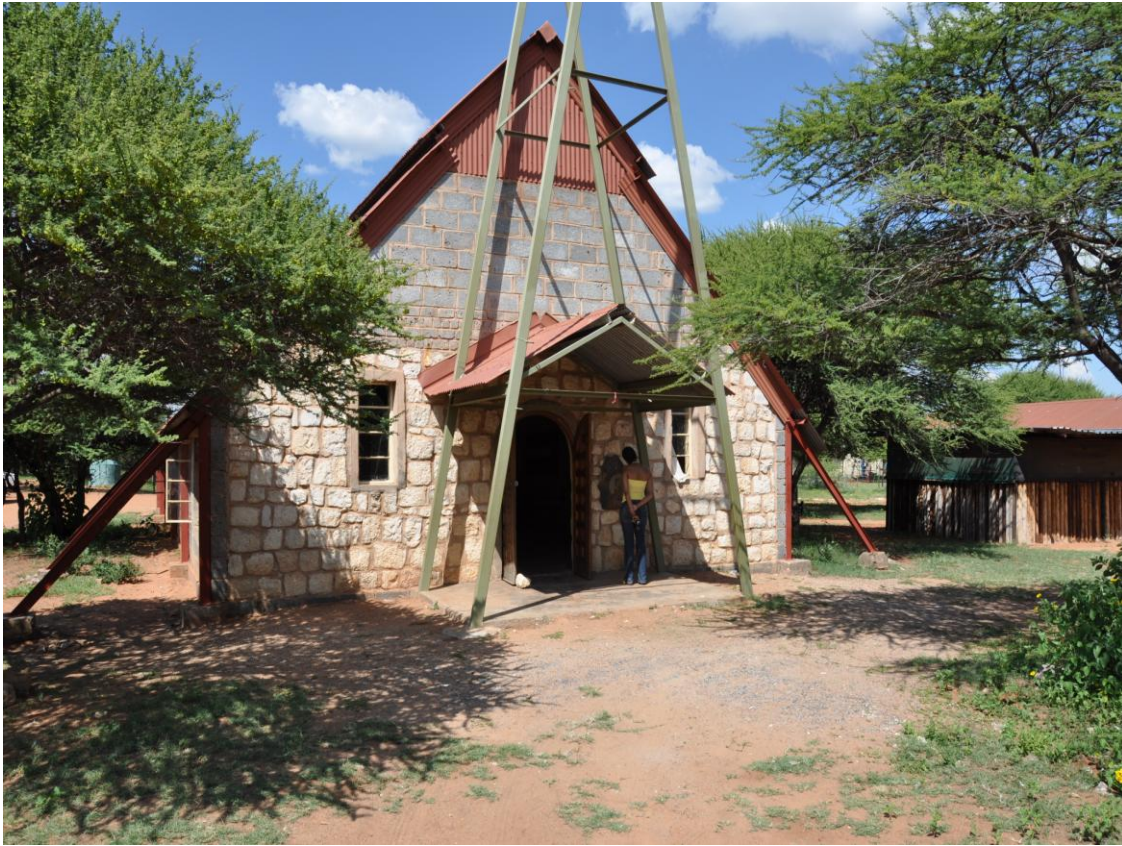
Dutch Reformed Church at D'Kar Settlement