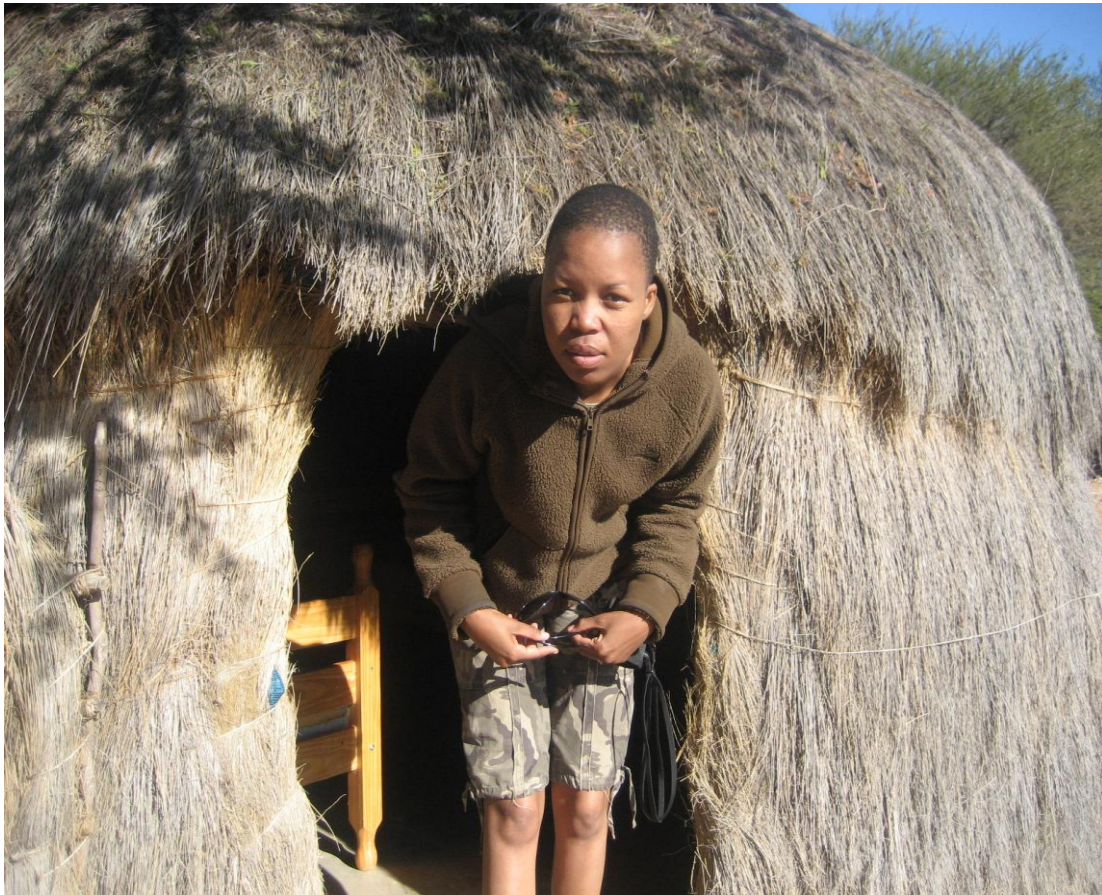
Figure 10 Traditional San hut (Mogwaafatshe) used as accommodation for tourist 2008

This farm was purchased in 1994 as contributory to the preservation of the San people's culture and way of life. It is owned by residents of D'Kar settlement. The farm is said to be the only game farm owned by the San people. Within the farm there are several activities that are income generating activities. These activities are based on the San cultural way of life. D'Qare Qare is a place where tourists come and learn about the San way of life. This includes camping, bush walking, dancing by the fire and story-telling told by the fire as well as a small curio shop.