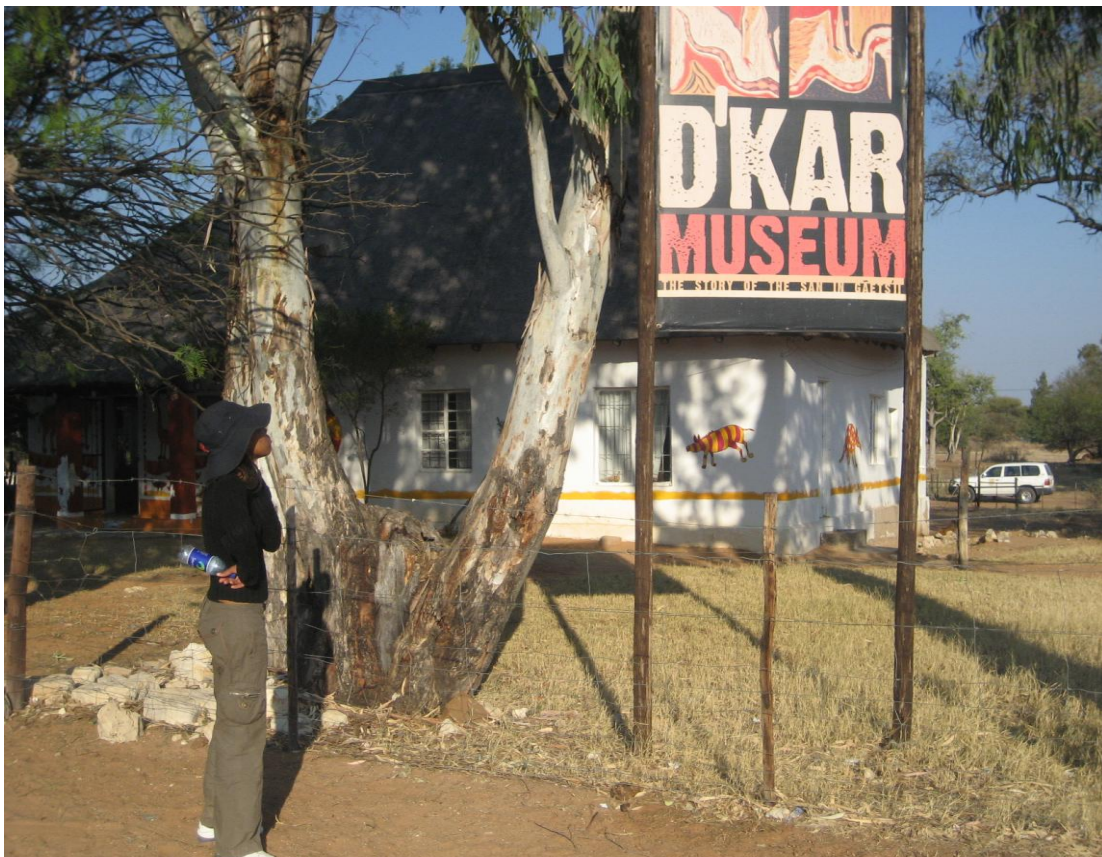
Figure 4. D'Kar Cultural Centre

the help of others. I intend to explore and find out from individuals involved in these activities and the founding members how these projects have come about and the extent to which the San people are involved as well as how individuals' lives have been impacted by these projects. I find it imperative to interview members who are involved to try and find out the balance between what these project bring as an alternative and how they have worked towards achieving a sustainable lifestyle in view of the changing times and global cultural invasion.