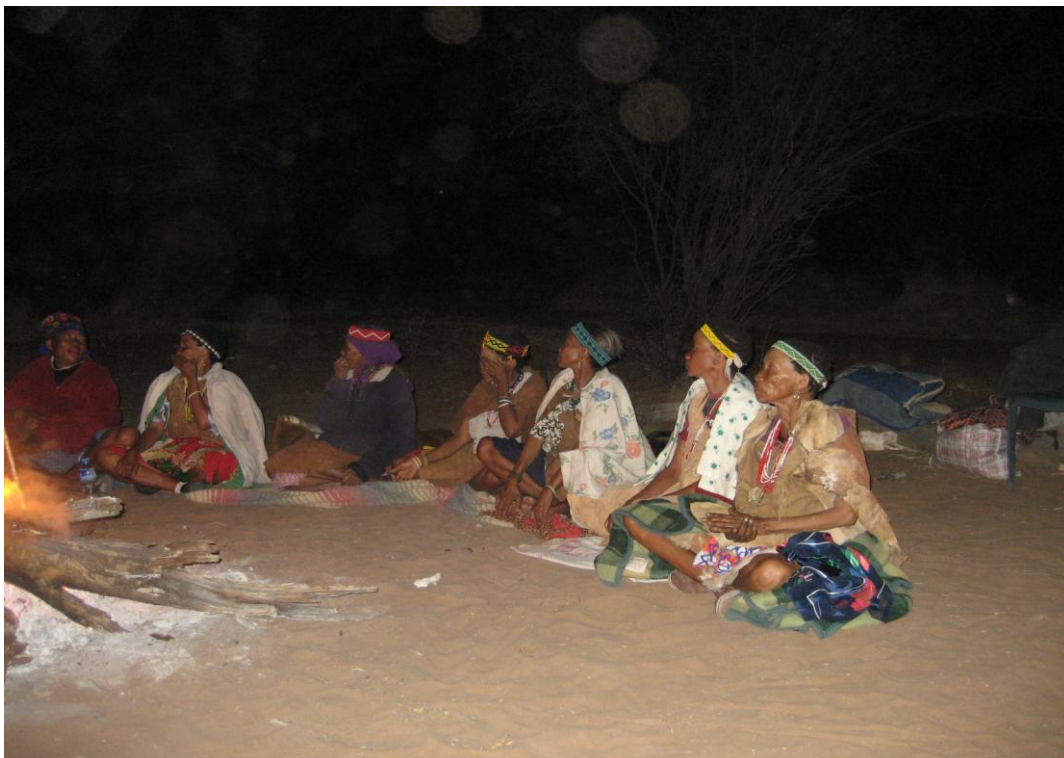
Figure 13 dance ritual

During the San dance women are more engaged in clapping of hands. They have little participation in dancing as they are the singers. However there are some songs that women can dance with men. When witnessing the dance the women came with their children to share in the experience of the dance.