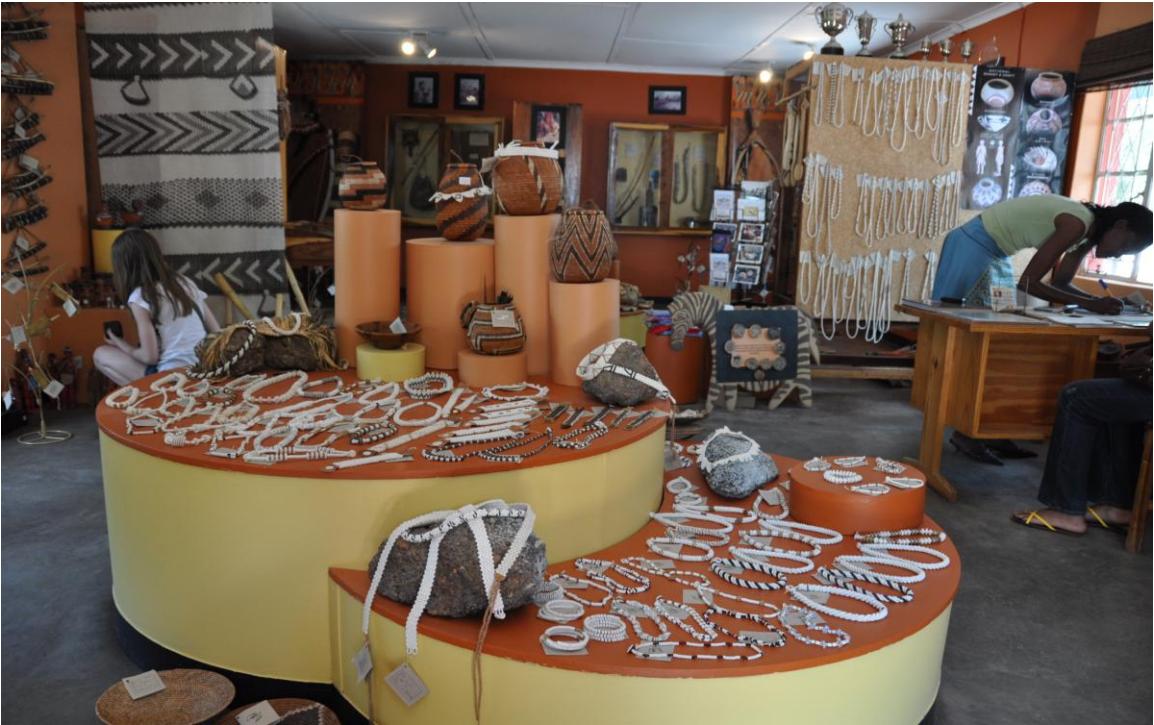
Arts and craft made by San women and sold to tourists in Gantsi