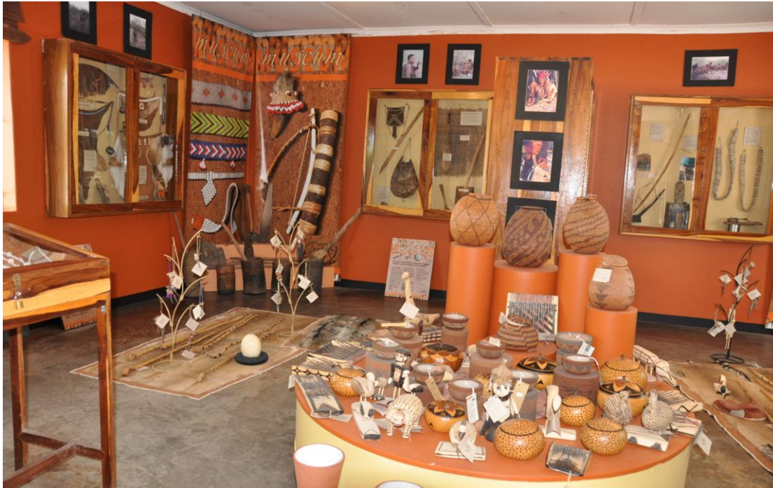
Figure 2. Ornaments

craftsmanship of the San People. At Ghantsi Craft these jewellery and ornaments are made by some skilled elderly women and some youths who are keen to learn from the jewellery makers. The crafts are then sold to individuals and tourists alike and the proceeds go to helping the women who make them. The paintings are done at D'Kar by both men and women. The Kuru has created an arts and craft centre where painting is done and the painting are later sold and some proceeds go to helping the artist and maintaining their craftsmanship. 5