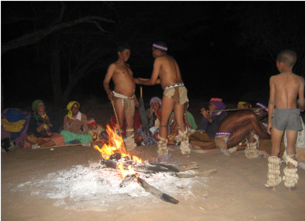
Figure 3. Healing dance

maintain the farm and pay the workers. The various activities include bush walking which is lead by a San guide, dancing by the fire and oral traditional stories told by the fire and healing dance. 6