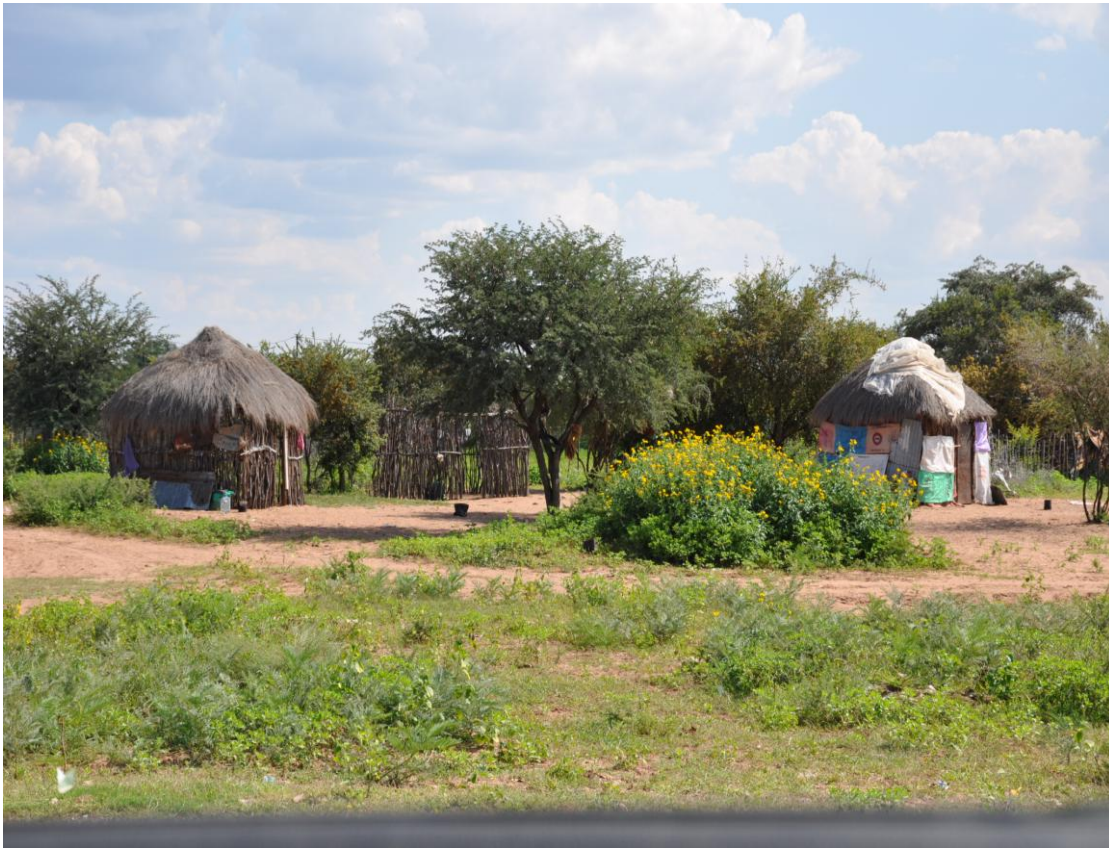
Some of the residential houses at D'kar settlement