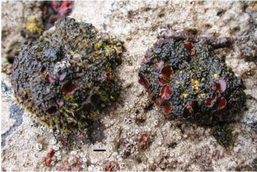
Fig. 3. Psoroma buchananii photographed wet in the field in Pali-Aike National Park, southern Chile in 2000.