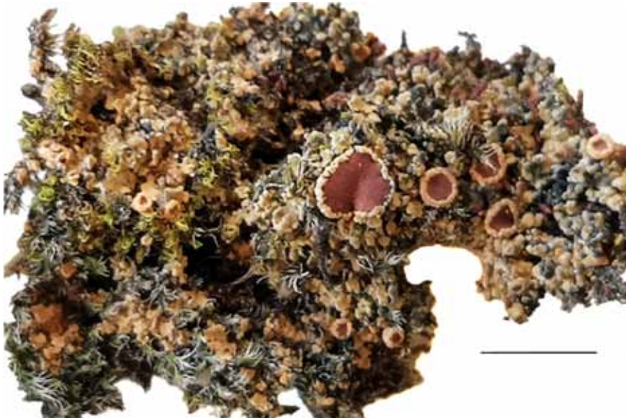
Fig. 4. Psoroma nigropunctatum , holotype. Scale bar = 5 mm.