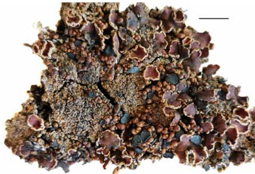
Fig. 2. Psoroma buchananii , associated with Bibhya bullata (Meyen & Flot.) Kistenich, Australia, Victoria, Elix 40758 & Streimann (CANB). Scale bar = 5 mm.