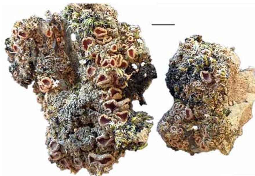
Fig. 1. Psoroma buchananii , New Zealand, Southland, Knight (OTA 61734; TROM). Scale bar = 5 mm.