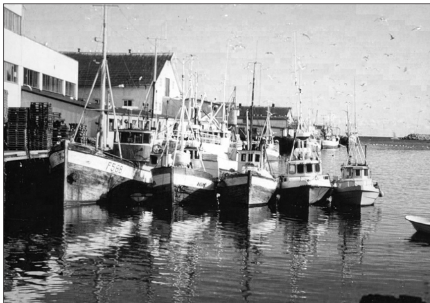
Figure 3. Low tech Norwegian fishing vessels from the 1980s

During the 1930s, the relationship between fish and fishers started to become more complex, both in technological and institutional terms. With the introduction of trawlers, a continuous all-year industrial capitalist off-shore fishery was