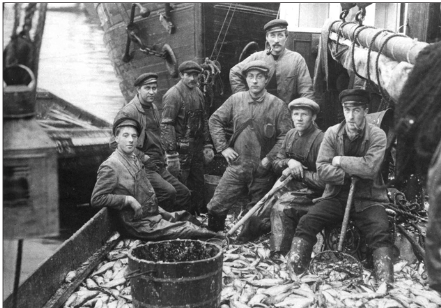
Figure 2. Fishers, vessel, and fish in the 1920s

Once upon a time there were fish, vessels, and men like those we see in Figure 2. In the 1920s, when this photo was taken, human shoulders and arms were still a main source of energy in Norwegian and NL fisheries (see Illich, 1973). Although there were a few larger steam ships in the herring fisheries, small fishing vessels