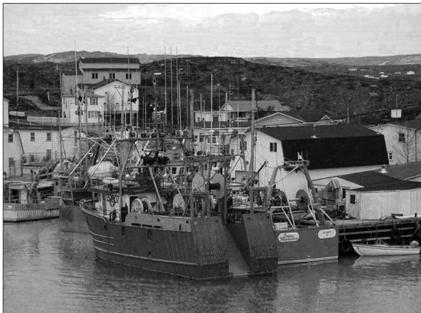
Figure 5. Fish capture machines from Newfoundland

It is obvious that the fishing enterprise today is not only a boat, the crew members and the affective relations between the crew, but a mix of many professional systems that all aim to contribute to optimal efficiency in all subsystems of the operations for which they are responsible. One result of these changes is the reduced need for manpower. A steering position at the starboard reeling, behind the hauling equipment, is now a standard feature on all vessels under 50 foot, so that the skipper can control both the vessel and the fish hauling machinery from one position (figure 6). Mechanisation has made it possible for three men to tend the same number of gillnets on a forty-two foot fishing vessel as six men once strained