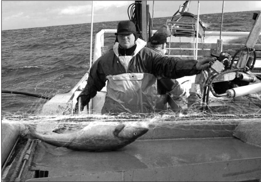
Figure 4. Onboard a modern Norwegian small-scale fish capture machine with fish, people gear and all its devices. The skipper is steering with his right hand, and is controlling the hydraulic hauler with his left hand, while the net clearing device is hanging at the stern.

By 2000, this had all changed. By the new millennium, a typical coastal fishing vessel in Norway was between thirty and forty-five feet long and often made out of fibreglass or steel with the wheelhouse in the front. The vessels have become very technologically sophisticated. Usually, no more than three people are working aboard, aided by hydraulic haulers and mechanical helpers that rely