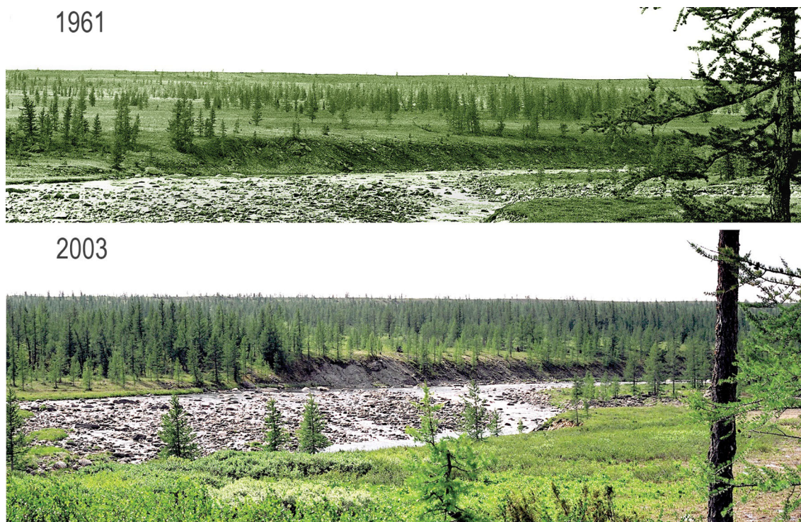
Fig. 3 Thickening of the larch forest on the left banks of the Enga-Yu River, Polar Urals, near Salekhard