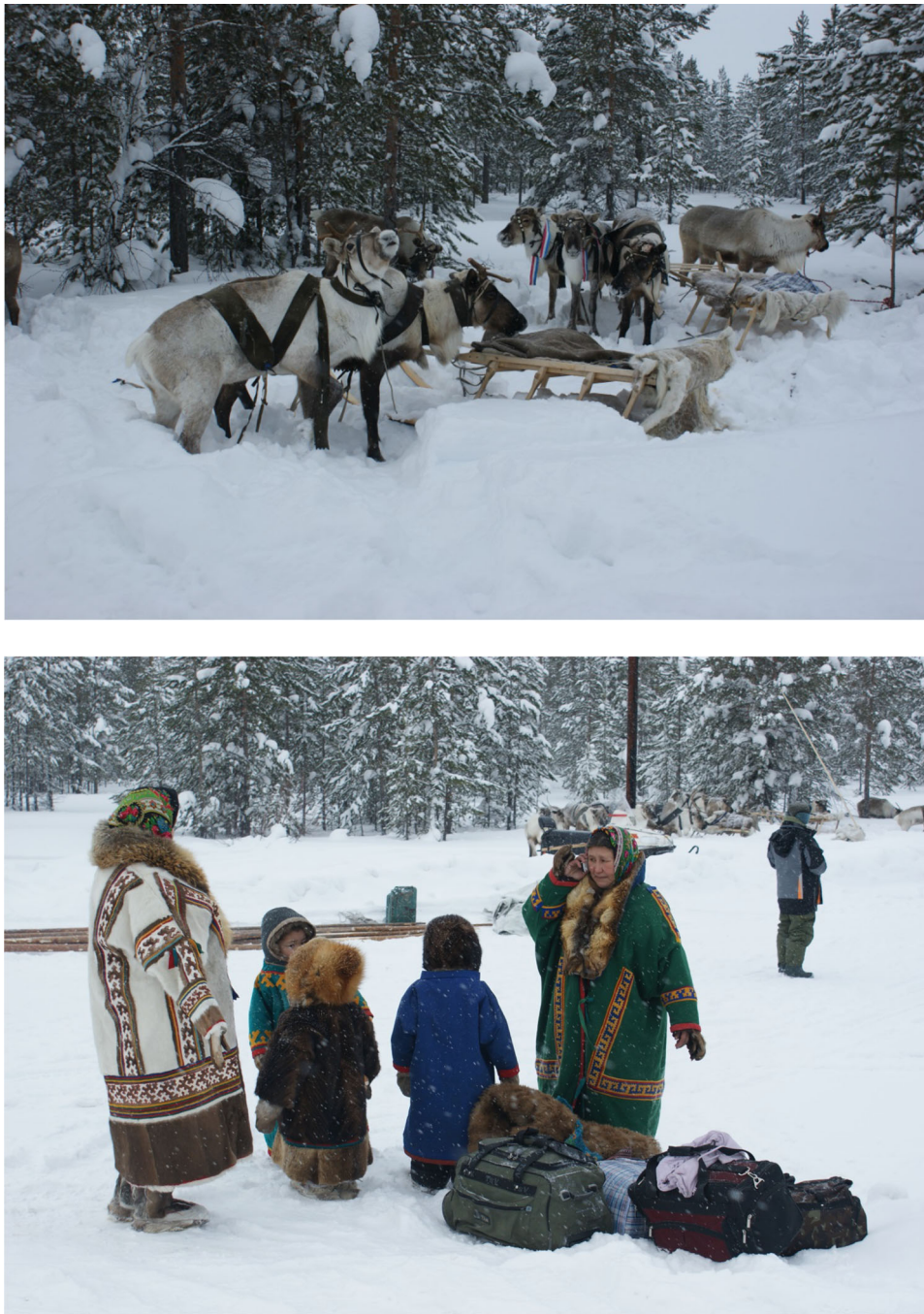
Fig. 5 People of the North are affected by climate change and globalization. For example, Khanty People keep many of their traditions such as use of reindeer but are part of modern society using mobile phones, snow scooters, etc.

ecosystems, as well as to the influx of external societal development processes and technology, although the changes are not always desirable for all the community members [e.g. western diet (Harvald and Hansen 2000)]. In some cases, new technology opportunities are quickly adopted by many (e.g. mobile phones, GPS, snow scooters, radio frequency identification for reindeer tagging [NIBIO 2016 Meld St. 2016–2017]), but in other cases local and