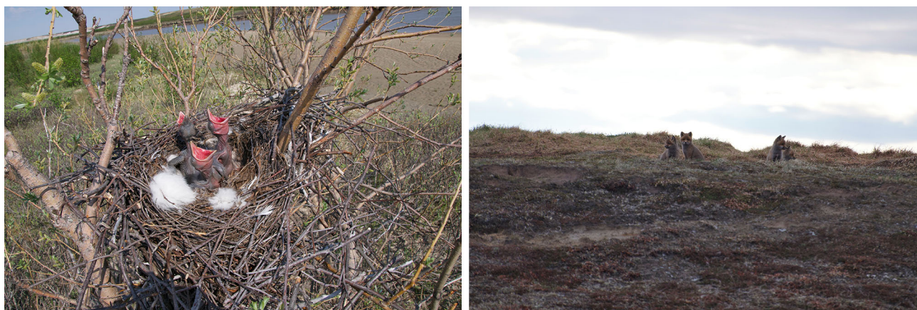
Fig. 4 Observed effects on the environment include changes in species abundance. Here, breeding of crows and red fox at 68° N.

the impacts of climate change vary across the globe, the majority of the world's population will experience changes in climate and weather systems and thus be affected by a rapidly changing climate and associated extreme weather events. Where populations are not directly affected adversely by climate change, they are likely to be subjected to in-migration from populations suffering dramatic changes such as coastal flooding and desertification.