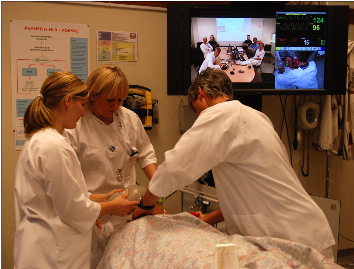
Figure 3. Simulated emergency training at Finnsnes