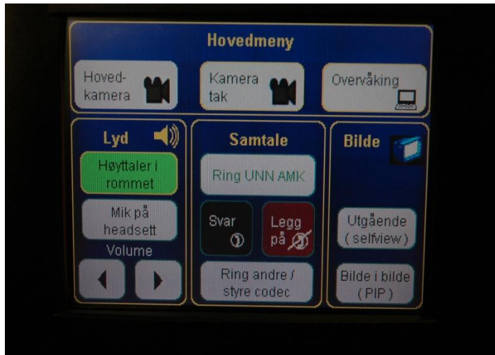
Picture 5: The first design of the Crestron© screen. Contact was established by pressing the answer button (in Norwegian: "Svar").

The steering system from Crestron© with a touch screen was designed to be very simple, controlled from the specialist's side. On the patient's side there was a "one-button principle": just touch the screen to accept the opening of communication.