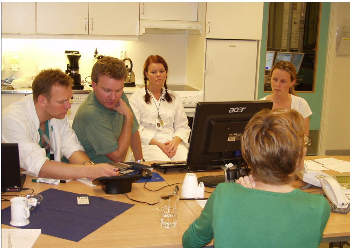
Figure 2. The specialists in the Dispatch Centre, UH Tromsø.