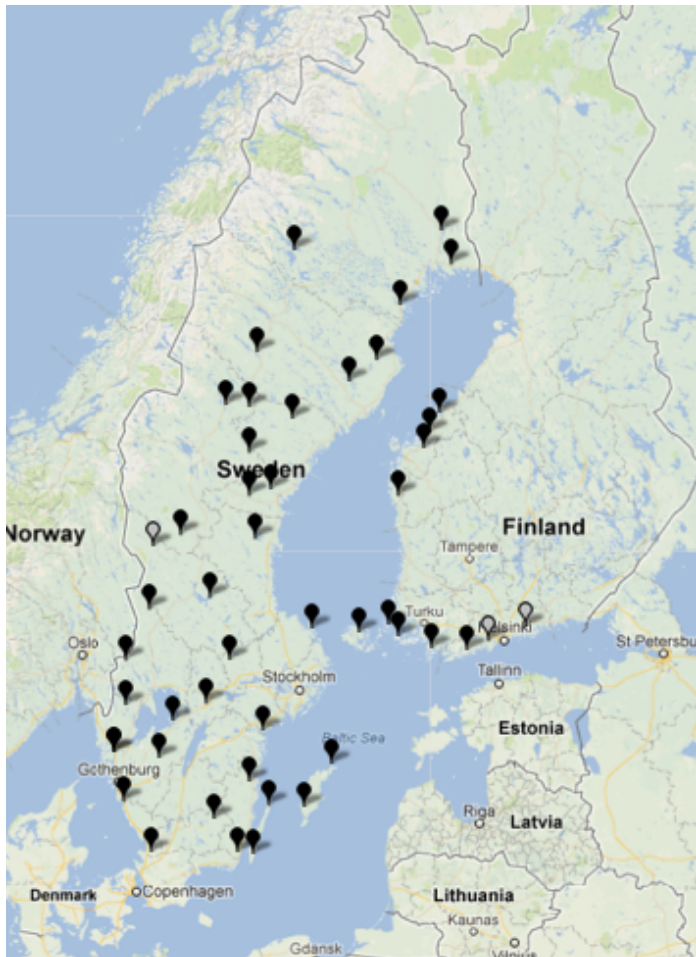
Map 4: Binding into an embedded object (#1395: Grannen ville at vi skulle passa sin katt. 'The neighbor wanted us to look after his cat.') (White = high score, grey = medium score, black = low score)