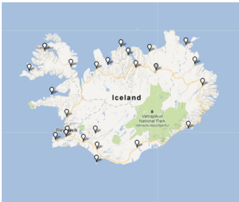
Map 5: Binding into an embedded object (#1395: Olafur vildi að ég tæki mynd af ser. 'Olaf wanted me to take a picture of him.') (White = high score, grey = medium score, black = low score)

The maps above show clearly that long-distance binding of an anaphor over an embedded subject in a finite complement clause is fully acceptable in Icelandic, but completely rejected in Swedish. We have no direct reasons to suspect that the difference between prepositional object (as in the Icelandic test sentence) and