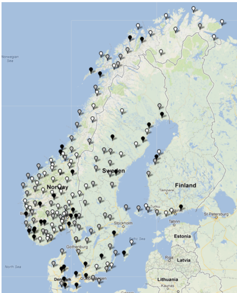
Map 1: Binding of possessive anaphor in an embedded subject by matrix subject.

(#156: Regjeringen regner ikke med at forslaget sitt vil få flertal. 'The government does not expect that its proposal will get a majority vote.') (White = high score, grey = medium score, black = low score)