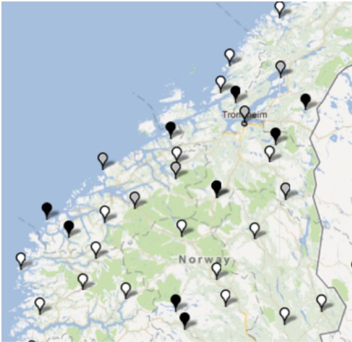
Map 3: Pronominal embedded possessor (#157: Regjeringen regner ikke med at forslaget dens vil få flertall. 'The government does not expect that its proposal will get a majority vote.') (White = high score, grey = medium score, black = low score)

Binding into an embedded object by the matrix subject was tested in Sweden, Finland and Iceland. In Sweden and Finland, the test sentence contained a possessive anaphor, and on Iceland, the test sentence contained a simple reflexive in a PP complement of a direct object. The sentences are given in (5) and (6) below. Note that the verb vilja ('want') here is construed with finite complement clauses in both Swedish and Icelandic: