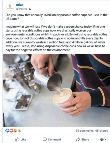
Figure 2. CSR social media stimuli.

( M_{\text{age}} = 38.1 ), gender (male: 50.7%), education (undergraduate degree: 26.7%) and ethnicity (non-Hispanic white: 73.4%). Thus, subsample equivalence was met as the two samples were homogeneous and comparable (Geuens & De Pelsmacker, 2017).