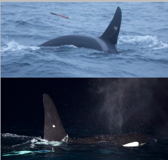
Killer whales were instrumented with GPS satellite tags. Whales were found to follow the herring southernly migration along the coast from their inshore overwintering areas to offshore spawning grounds. Additionally, herring density was found to impact the whale horizontal movements (Vogel et al 2021).