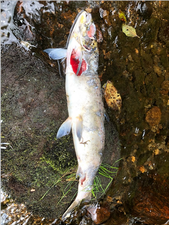
Atlantic salmon were tracked in the Norwegian river Aureelva with radio tags and temperature loggers. Tracking allowed recovery of tags brought on land by Eurasian river otters Lutra lutra and the date and time of predation was ascertained by matching the temperature logger with values from a temperature station on land and in the river.