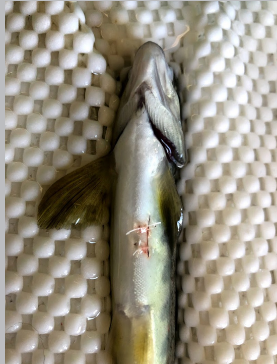
Predation sensor transmitters implanted in Atlantic salmon smolts in the river Vosso, western Norway provide details about the fate of the fish during their seaward migration. Predation sensors have an internal state machine and transmit orientation data to receivers so that analysts can track behaviour and fate at different phases of the migration (Lennox et al. 2021a).