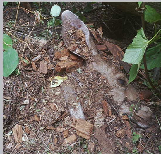
Cluster patterns in GPS locations for a cougar Puma concolor combined with mortality signals on a collared mule deer Odocoileus hemionus indicate the timing and location of predation. In some cases, cougars are displaced from kills by other predators, and only by having collars on both species do we understand how important these predator–predator interactions might be.