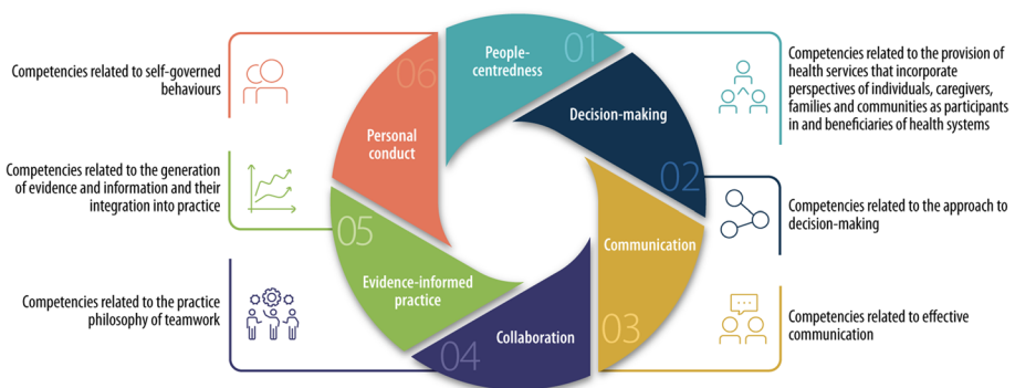
Fig. 1 Competency domains within the Global Competency and Outcomes Framework for UHC (WHO, 2022 p. 13)

Interprofessional education (IPE) and collaborative practice are recognized as potential routes for improving the quality of healthcare service delivery (Berwick et al., 2008). IPE occurs when workers or students from two or more professions learn with, from, and about each other to improve collaboration and the quality of care and services (Centre for the Advancement of IPE, 2016). In Norway and many other European and western countries, legislation regarding healthcare services, patients' rights to be involved in decisions concerning their care, and treatment in healthcare services have been claimed. However, this has not been dealt with thoroughly in health professional education. The 2015 Vancouver statement on "The patient's voice in health and social care professional education" has emphasized the importance of this issue in education. The statement aims to enhance patient involvement not only in a uni-professional manner but also in inter-professional learning, as "opportunities are often missed to expand patient involvement in education beyond individual professional programs to promote team-based education and care" (Towle et al., 2016, p. 21). One priority was to "facilitate a more holistic approach to patient partnerships and teamwork" (Towle et al., 2016, p. 22). This study explores this by delving into undergraduates' collaborative learning with patients in interprofessional clinical placements (Fig. 1).