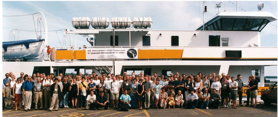
Fig. 25 Participants of the Fourth International Charr Symposium in Trois-Rivières, Québec, Canada, before the opening banquet during a six-hour cruise on the St. Lawrence River. David is center left in the front row

high fitness as measured by growth rates, whereas fish that combine tactics have lower fitness. There are more stayers in swift streams and more movers in slow streams. The mover tactic is dominant in lakes, both in brook charr and lake charr. These studies led to the proposal of a model for sympatric differentiation based on initial behavioural differences where fitness is a critical feature.