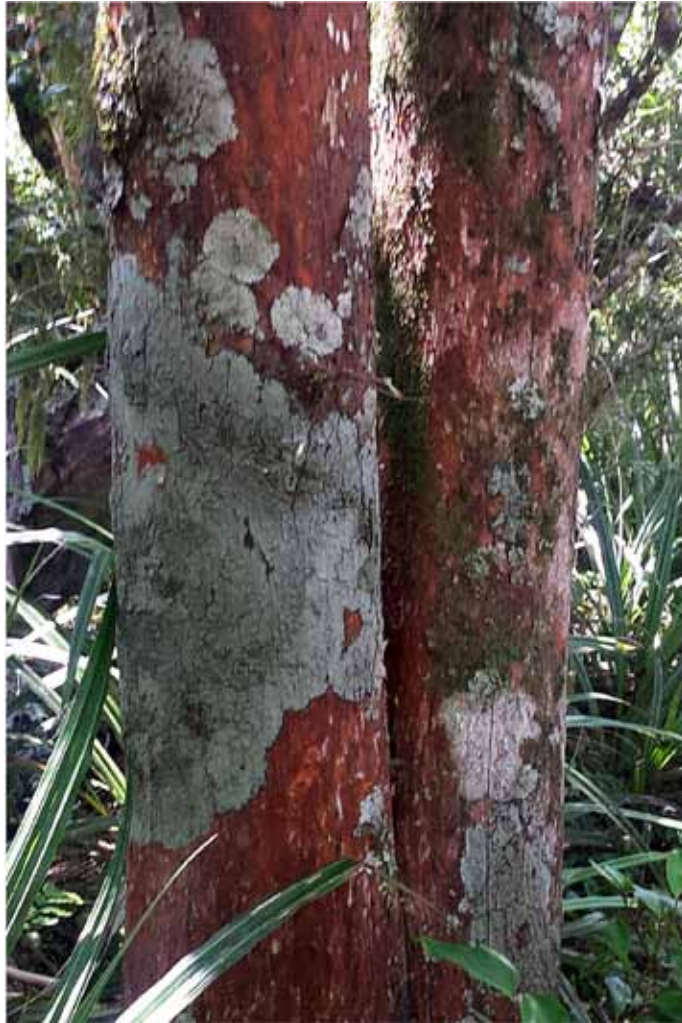
Fig. 2. Pannaria crispella along a path in Egmont National Park. The specimen was sampled as Elvebakk 16:151 .