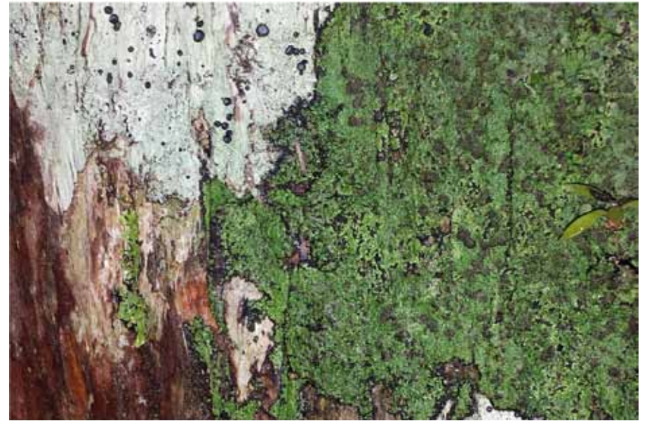
Fig. 3. A moist specimen of Pannaria crispella in Egmont National Park, sampled as Elvebakk 16:157A . The associated species in the upper left corner is Megalospora knightii Sipman.