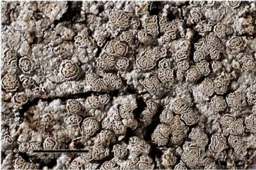
Fig. 5. Pannaria crispella , Elvebakk 16:151, photo: Julia Brekmo. Scale-bar = 0.5 cm.