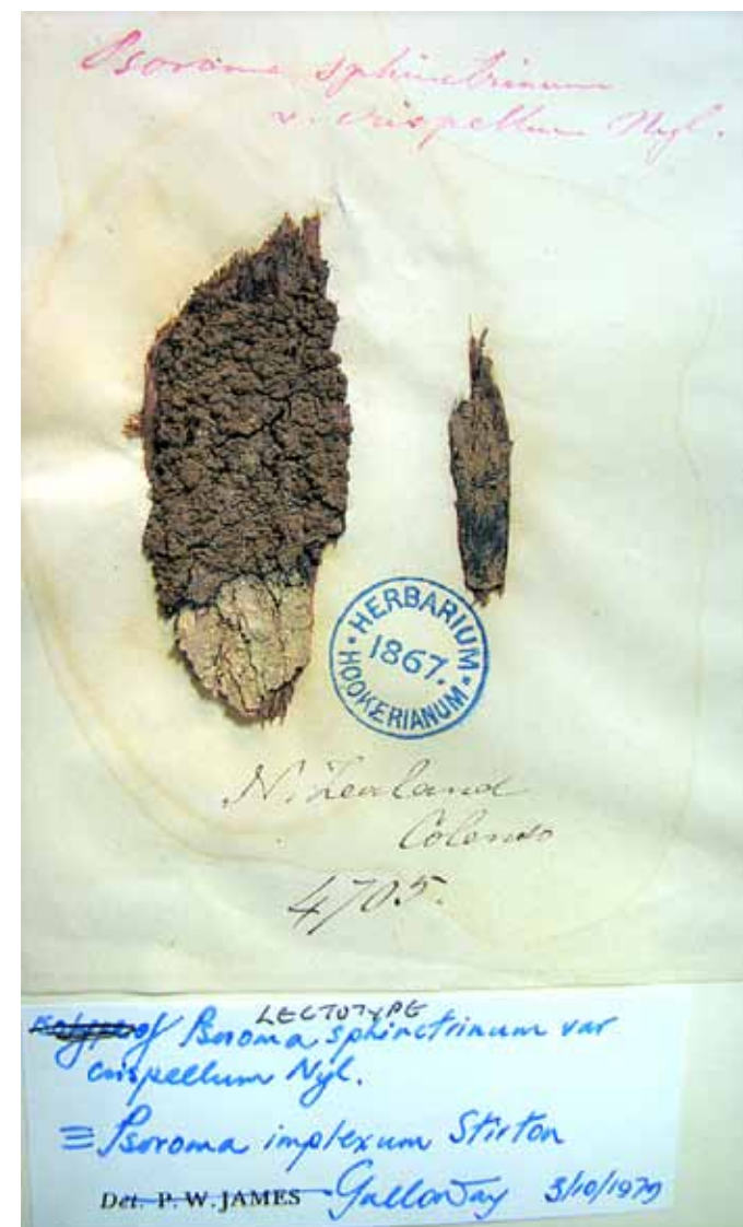
Fig. 1. Psoroma sphinctrinum var. crispellum , lectotype.