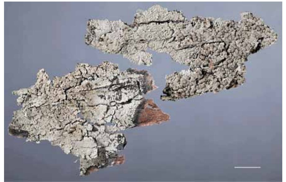
Fig. 4. Pannaria crispella , Elvebakk 16:151 , photo: Julia Brekmo. Scale-bar = 1 cm.