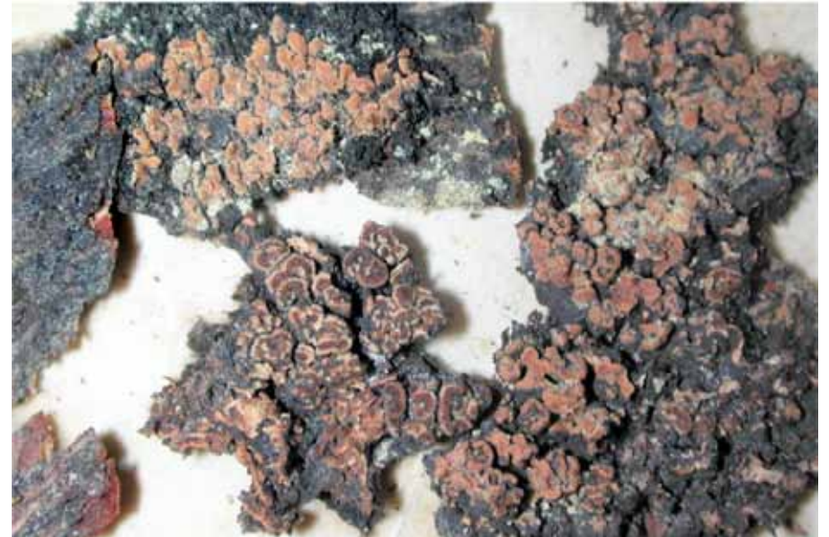
Fig. 6B. Pannaria campbelliana, isolectotype