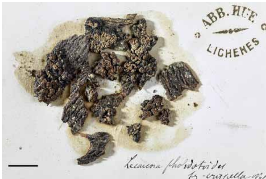
Fig. 6A. Pannaria campbelliana , isolectotype. Scale bar = 1 cm.