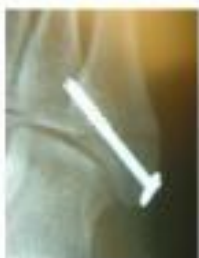
Figure 4: A 3.0mm angulated screw in a proximal-plantar to distal-dorsal direction [37].