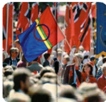
Indigenous rights – a procedural approach

For this purpose, with indigenous participation as the red thread, I prefer a procedural approach in order to account for the understanding of participation in a Sámi-Norwegian context which could be divided into three stages of progress. This is a development parallel to the evolvement of indigenous rights as "bundles" of rights in international law.