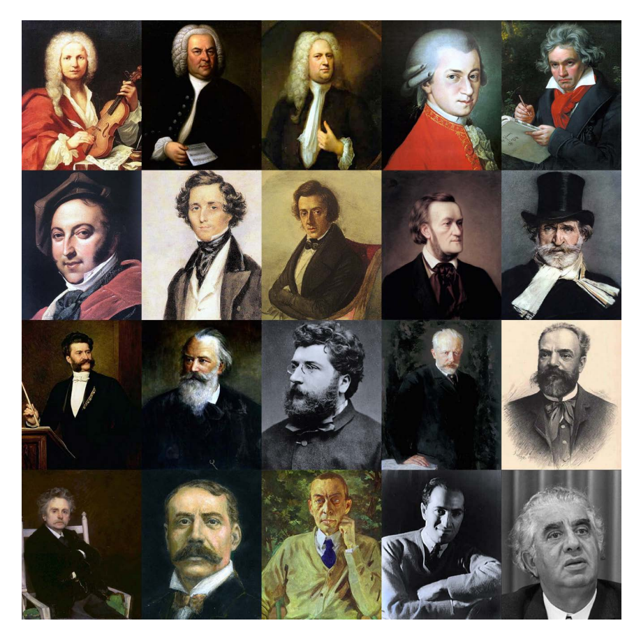
Figure 2. Montage of composers portraying the Western art music canon in Wikipedia/Wikimedia

at UiT is combined with popular music and called rhythmic music). The students' background in music history mainly derives from their high school experiences, where the subject is taught as a reductionist version of the canon of Western art music, jazz, and pop/rock. Another major source of influence is students' main instrument teachers, who have all been trained in the canon, where the most common teaching method (master-apprentice) transfers the canon to new generations. It is not surprising, then, that students' expectations are shaped by a specific canon, where the canon of Western art music in particular is visualized in many merchandizing products (Fig. 2).