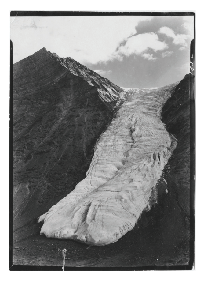
Fig. 4 Boyd's photograph of Morainless Glacier is an example of the high technical quality of her images, which make it possible to study the different structures in the ice.

"Why feminist glaciology?" ask Carey et al. (2016), in a controversial article about women and gender in glaciological research. In addition to calling for a focus on women's contributions to the development of the field, they also ask to what extent the discipline itself is gendered. They claim that glaciology—especially when it is associated with rock climbing and polar expeditions—is characterized by a masculine discourse that privileges physical achievement, heroism and conquest (Carey et al. 2016: 5). It is striking that these qualities are missing in Boyd's descriptions of her own expeditions. She does not deny that the weather and nature conditions were often challenging, but instead emphasizes what can be called her dialogue with the Arctic. As her books show, it was within this dialogue that her photographs were created.