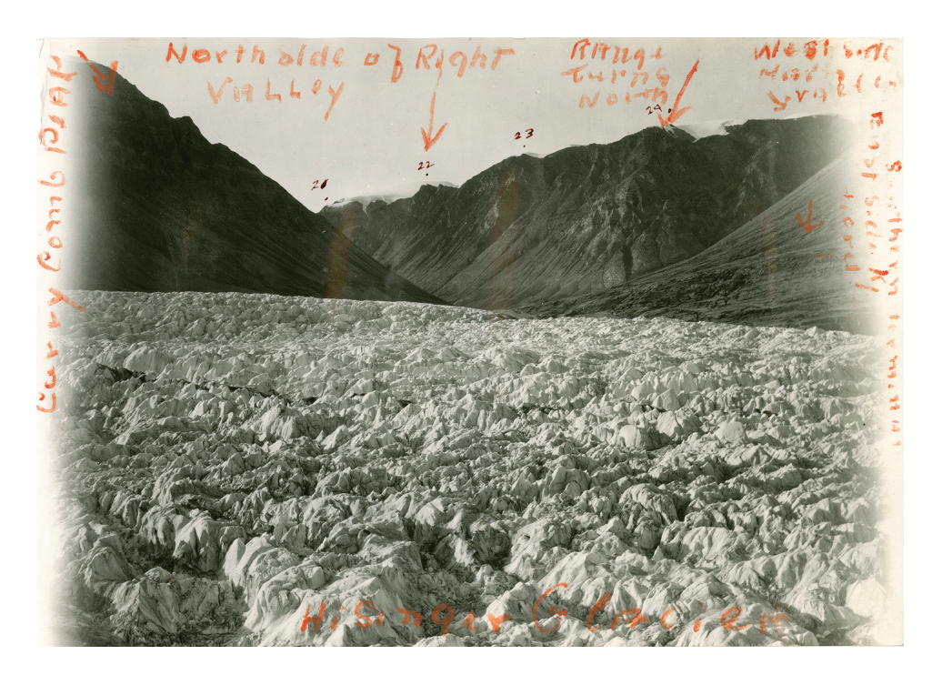
Fig. 3 This photograph, of Hisingen Glacier, in Dickson Fjord, Greenland, on 6 August 1931, is one of many annotated by Louise Boyd to show the location of the view on a corresponding map. In this way, the photographs could be used as a basis for the construction of better maps.

used to achieve a three-dimensional representation of landscapes. It requires photographs of a given place from several perspectives. It is clear from her own writing and the expedition participants' accounts that she devoted much energy into developing techniques to reconstruct the appearance of glaciers from images taken from different angles and she learned to adapt her instruments to local conditions. Her quality-conscious approach was honed by Isaiah Bowman, the AGS director, as revealed in their correspondence in the MHM. On the basis of the photographs produced during Boyd's 1928 expedition to Greenland—which she had called "a photographic reconnaissance" (1932: 532, 1935: 2)-Bowman advised her about what she ought to photograph on her next expedition and the contextual information she should provide for the images. Following his guidance, armed with cameras better suited to the polar environment and taking advantage of better summer weather, Boyd took photographs on her next expedition that showed such marked improvement that Bowman could "hardly believe that they were taken by the same woman! You have done a first-class job" (letter from Bowman to Boyd 15 March 1932, MHM; letter from Boyd to Bowman 25 March 1932, MHM). As a result, the AGS subsequently prepared (with her financing) detailed and accurate topographic maps (Fig. 3). She donated all her photographs to the AGS.