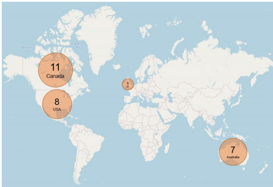
Figure 2: Map illustrating global distribution of included articles.

ABI, acquired brain injury. TBI, traumatic brain injury.