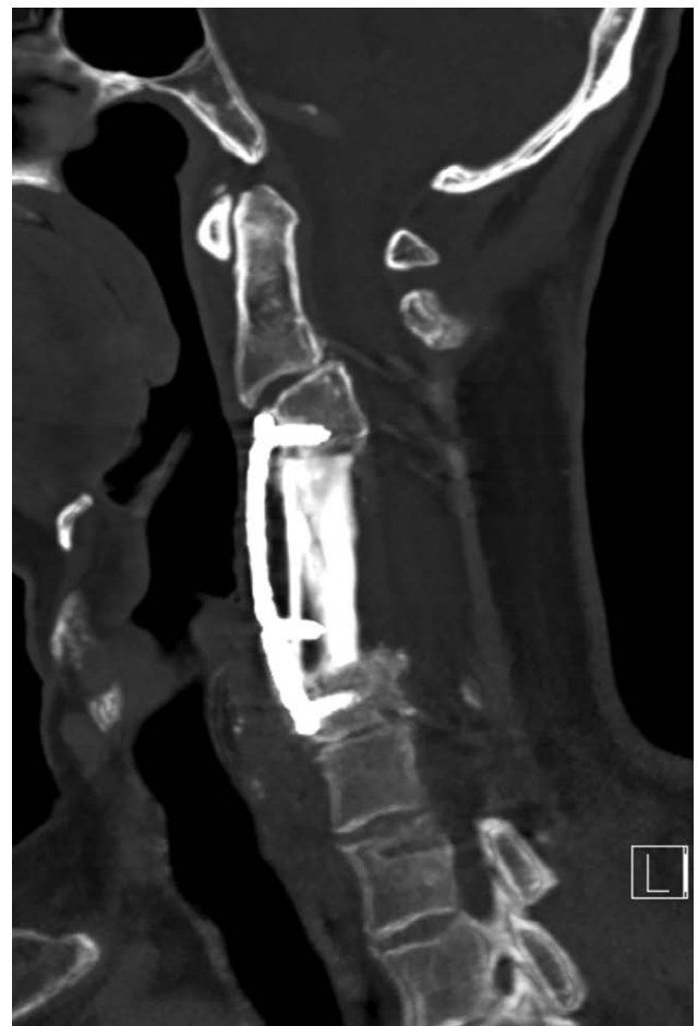
Fig. 4. The CT scan image showing the sagittal projection of the FVFG fixated with the anterior and posterior plate at 5 months.

after failed attempts with instrumentation, allografts, insertion of nonvascularized bone grafts, or having failed with previous surgical decompression or antibiotic treatment. To manage these complex cases, a high level of reconstructive expertise and multidisciplinary cooperation is required. One must control infection, obliterate dead space, provide skeletal stability for the axial load, and reduce deformity while appreciating the wide range of mobility in the neck and its compact and complex neurovascular anatomy. 2