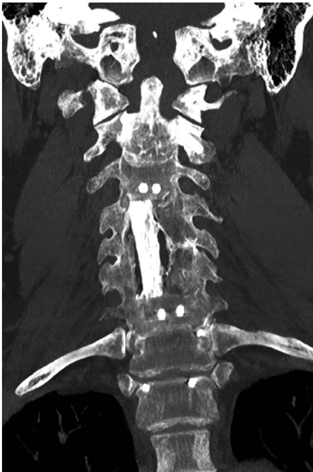
Fig. 3. The CT scan image showing the coronal projection of the FVFG fixated with the anterior plate after 5 years.