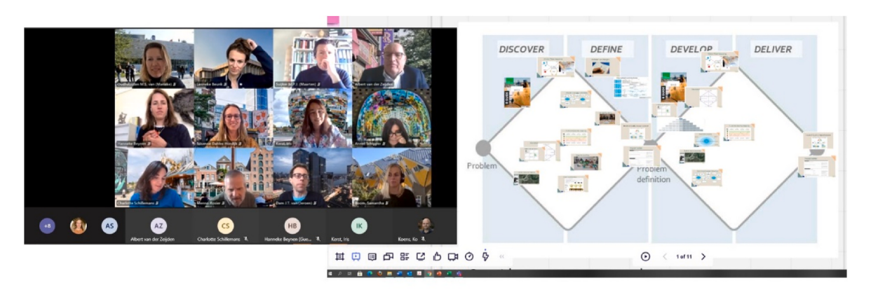
Fig. 4. Screen shot compilation from a co-crafting workshop.

The journal notes were analysed using a codebook approach to thematic analysis (Braun & Clark, 2021), with codes based on the three reflexivity mechanisms and the four characteristics of process models to design tourism experience systems. Following convention, the analysed data in reflexive journalling was presented in narrative form, supported