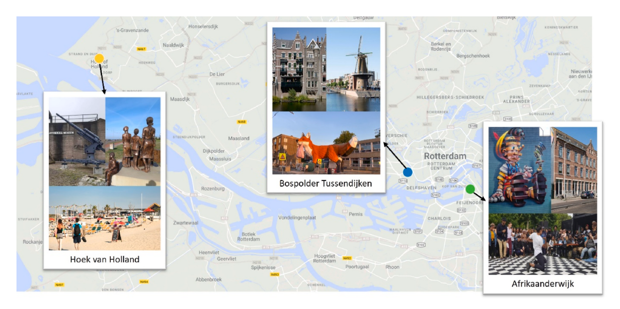
Fig. 2. Impression of participating Rotterdam neighbourhoods in the living labs.

interim testing, for instance to get approval to move to a next stage of the design process (i.e., develop a prototype). Similarly, a formative evaluation is often applied ex-post when interim tests of the artefact under development were evaluated using summative evaluation episodes. This approach to evaluation stimulates the iterative nature of learning through building (Kuechler & Vaishnavi, 2008) and therefore supports the co-evolution of problem and solution throughout the development of the artefact (Dorst & Cross, 2001).