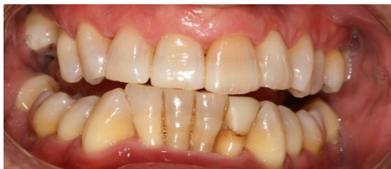
Figure 10. Osteogenesis imperfecta. Clinical Photos from Catarina Wallman.