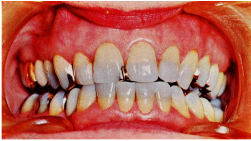
Figure 1. Bluish discoloration of crown half of teeth. The increased density of the dentine is seen as yellow-to-brown change on the gingival half of the teeth [9].