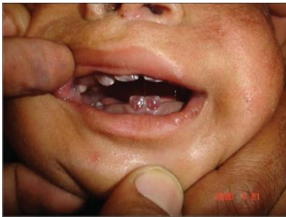
Figure 2. A congenital erythropoietic porphyria patient with red-brown pigments in the teeth. ( http://www.ncbi.nlm.nih.gov/pubmed/21572804 )