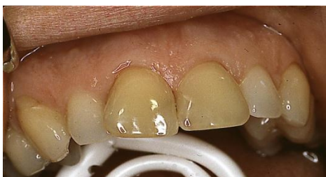
Figure 17 Trauma. Clinical Photos from Catarina Wallman.