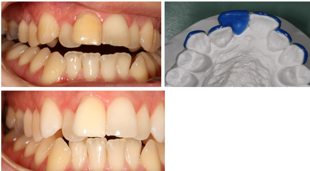
Figure 16. Obliterated tooth 11 after trauma. Clinical Photos from Catarina Wallman.