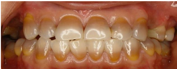
Figure 12. Tetracycline staining.