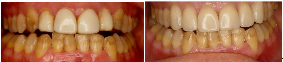
Figure 13. Tetracycline-stained teeth with laminates in the upper jaw and buccal composites on front teeth in the lower jaw (right picture).