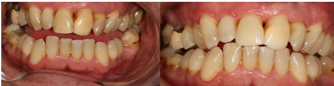
Figure 19. Gingival recession. Bleaching of the root surfaces.