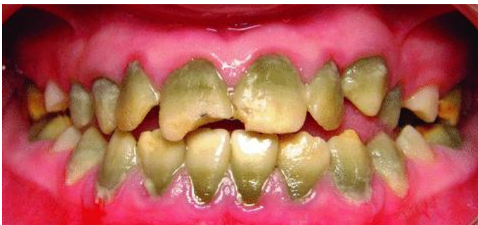
Figure 3. Congenital hyperbilirubinaemia patient with green staining teeth.