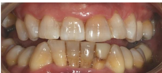
Figure 9. Osteogenesis imperfecta. Clinical Photos from Catarina Wallman.