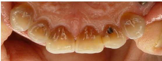
Figure 7. Dentinogenesis imperfecta.