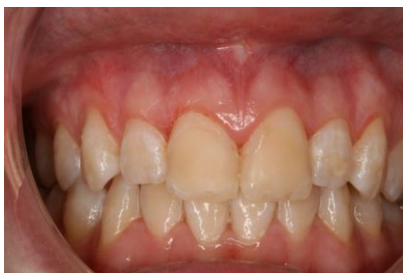
Figure 4. Amelogenesis imperfecta. Clinical Photos from Catarina Wallman.