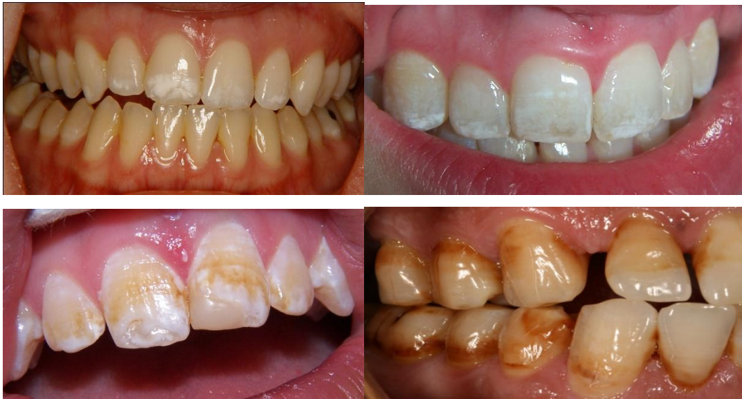
Figure 15. Fluorosis.