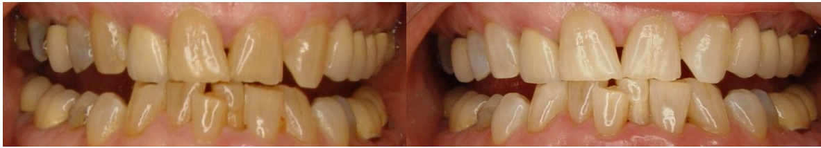
Figure 18. Nightguard vital bleaching with 10% and 15% carbamide peroxid. An individual program over 2 weeks.