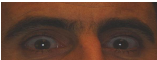
Figure 8. Osteogenesis imperfecta. Blue sclera. Clinical Photos from Catarina Wallman.