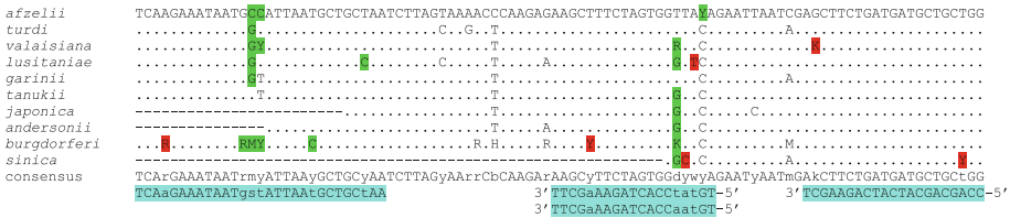
Fig. 1 Multiple sequence alignment of target, primer and probe sequences. Dots indicated identity to the reference sequence. Hyphens indicate regions where no sequence information is available. The following IUPAC ambiguity codes are used: Y = T/C; R = A/G; M = A/C; S = G/C; H = A/C/T; K = G/T; D = A/G/T; B = C/T/G. Variant positions are indicated by lower case letters in the consensus and primer/probe sequences. Variants accommodated by G:T basepairing or degeneracy of the primer/probe sequence are highlighted in green in the target sequence. Variants not so accommodated are highlighted in red . Primer and probe sequences are highlighted in blue . Unless otherwise noted, sequences are written 5' – 3'. (Color figure online)