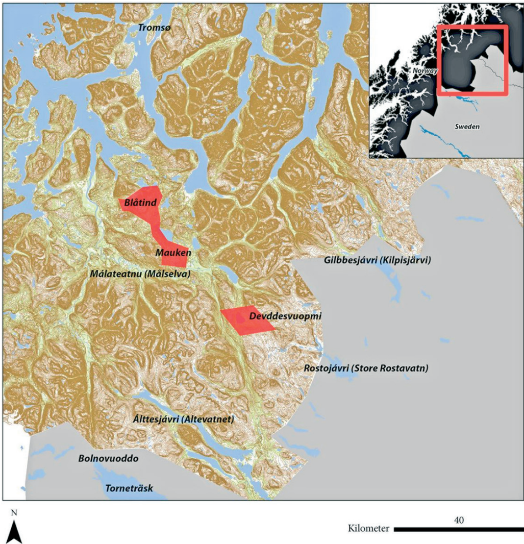
Fig. 1. Interior of Troms county (Inner Troms), areas of archaeological investigation.