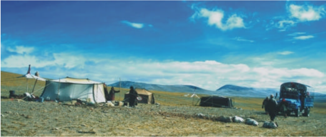
Fig. 3. Nomad camp in the Aru basin, with a recently purchased truck used for moving camp and transporting wool to market.