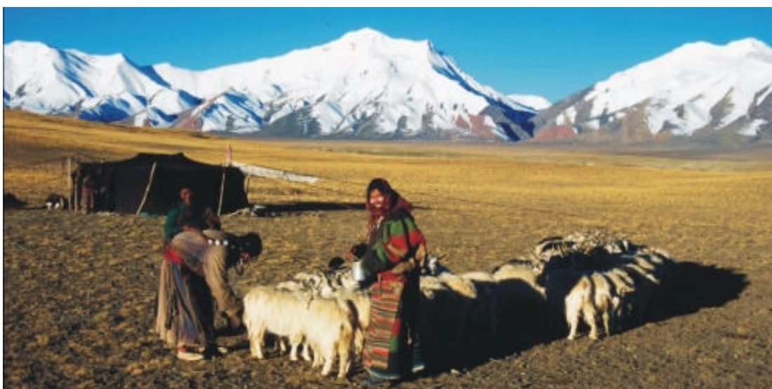
Fig. 4. Nomad women milking goats at 5000 m elevation in the Aru basin. Chiru and gazelle are common and kiang occasional on the plains in the foreground, whereas wild yak, blue sheep, snow leopard and brown bear are found in the lower parts of the mountains.

The nomads throughout the area are currently undergoing a modernising of livelihoods affected by the introduction of permanent winter houses (altering seasonal migration patterns), development of local community administrative centers, vehicular transportation, changing international trade in shahtoosh and cashmere and a move towards stricter wildlife conservation laws (Næss et al. , 2004). As Schaller & Gu (1994) have noted, "in 1991, 5 families (~40 people) moved their 600 sheep and goats and 45 yaks into the [Aru] basin permanently, primarily to hunt wildlife". This was in addition to about 21 families with about 8600 livestock that used the basin on a seasonal basis at that time (Schaller & Gu, 1994). In 2000, there were about 19 permanently resident families within the Aru basin, and another 30 families that used it part