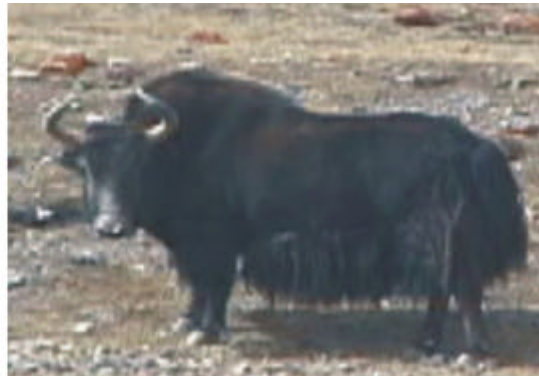
Fig. 2. Chiru (Tibetan antelope) and wild yak in the Aru basin.

Some 30 000 nomadic pastoralists depend on rangelands within the reserve for livestock grazing, and those in areas with significant wildlife density have traditionally depended in part on hunting for supplementary subsistence and trade (in part for shahtoosh). With rapid changes in wildlife markets, government subsidised modernisation of pastoralism, and concerns over preserving Tibet's wildlife populations, the establishment of the nature preserve has brought into sharp focus conflicting aspects of these various factors. The TAR's 1997 request for assistance focussed on development aid associated with the creation of the reserve; our project aims to provide baseline information upon which management of wildlife and livestock can be developed to ensure the continued presence of threatened wildlife as well as a better standard of living for nomads in the reserve.