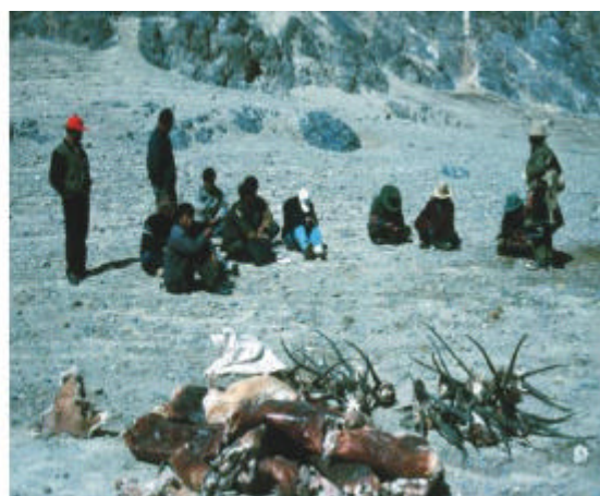
Fig. 5. Confiscation of antelope traps from a nomad (left) and chiru pelts and horns confiscated from traders (right) who bought them from nomads, both just SE of the Aru basin.