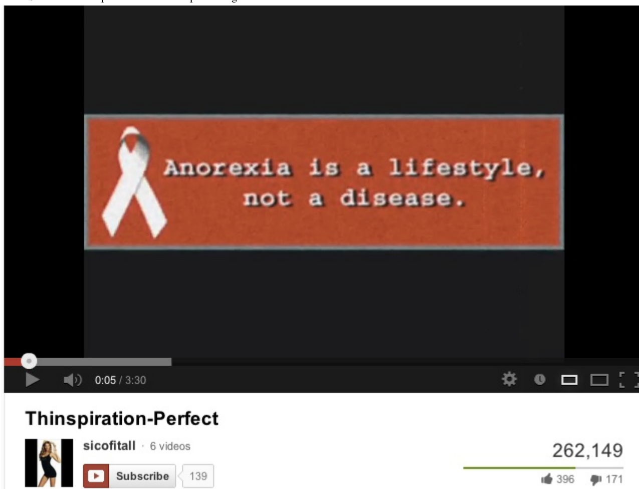
Figure 1. Screenshot of a pro-anorexia video promoting misinformation.